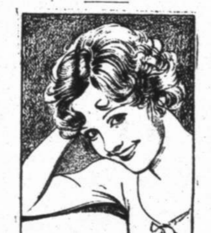
NANCY CARROLL in "Stolen Heaven" a Paramount Picture

—brings to the screen one of the most versatile actresses known Nancy Carroll, Supporting Miss Carroll is Phillip Holmes. These two have the leads in the picture "Stolen Heaven" In this story Nancy, who is an out of a job night club dancer meets Holmes, who discouraged with life has just stolen a lot of money. After talking things over they decide to spend the entire sum, $20,000, in one grand holiday in Florida. Here they enjoy themselves but the money is soon gone and they find themselves in the hands of the law. Complications and more trouble follow, but love wins out. See this superlative drama!