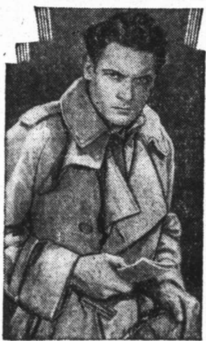
Friday and Saturday

—brings to the Palace Theatre that breath taking spectacle, "Body and Soul" starring Elissa Landi and Charles Farrell. The scenes are laid during the late war with three members of R. F. C. enacting the principal roles: Elissa Landi and Myrna Loy have the feminine leads. The story begins with Charles Farrell setting out to find Pom Pom, a girl friend of his deceased buddy. He does find her and loves her, only to find that she is accused of being a spy. They are both arrested by Scotland Yard, but Farrell manages to escape vowing to kill Pom Pom. He finds her in London where her true identity is revealed and love wins out. Elissa Landi who enacts the role of Pom Pom has made a sensational debut in this country, having come from Europe. Here she has won the praise and admiration of all who see her.