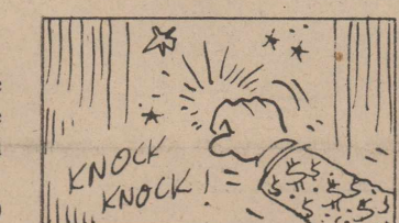
When fortune knocks, be sure to open the door.