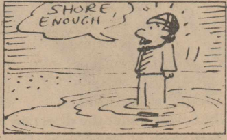
Longshoreman is a contraction of along-shore-man.