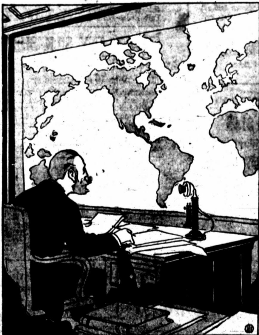
All the world in his textbook and his problems are his to solve