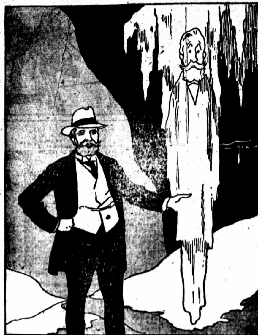
The "Human Iceberg" is a good joke to the Secretary

The elder Hughes was of Welsh origin, so the Secretary of State has a blood tie to Welshman Davis over at the Labor Department. Secretary Davis is likewise a Baptist, which faith the two men may have had passed down to them from the same source. But Secretary Hughes' mother's name was