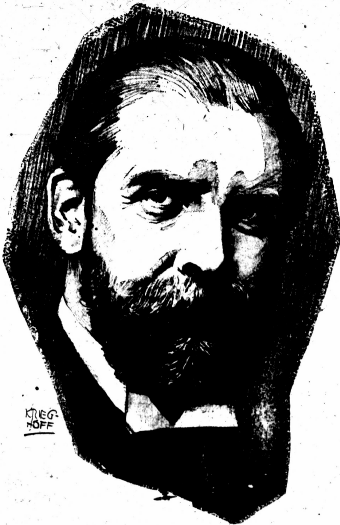
Secretary of State Charles Evans Hughes

He is an odd man, is Charles Evans Hughes, in the importance he places on the proper performance of the job. You remember Joseph Pulitzer, the publisher, when he died, willed Charles Evans Hughes $100,000, and that Hughes was a poor man with a considerable family, just coming out of the governorship of New York. That $100,000 would have meant a good deal to him and his family. Yet Mr. Hughes refused the bequest. Its acceptance might have interfered with the work that he had ahead of him.