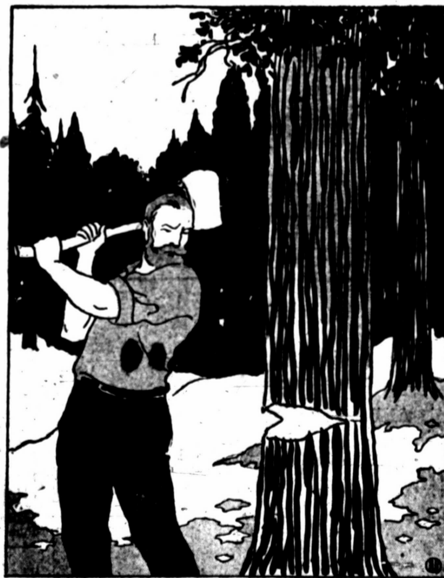
He hews to the line, let the chips fall where they will