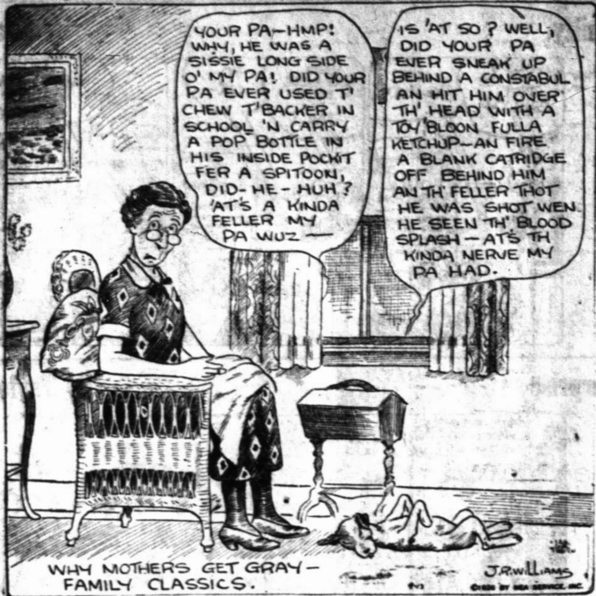
WHY MOTHERS GET GRAY - FAMILY CLASSICS.