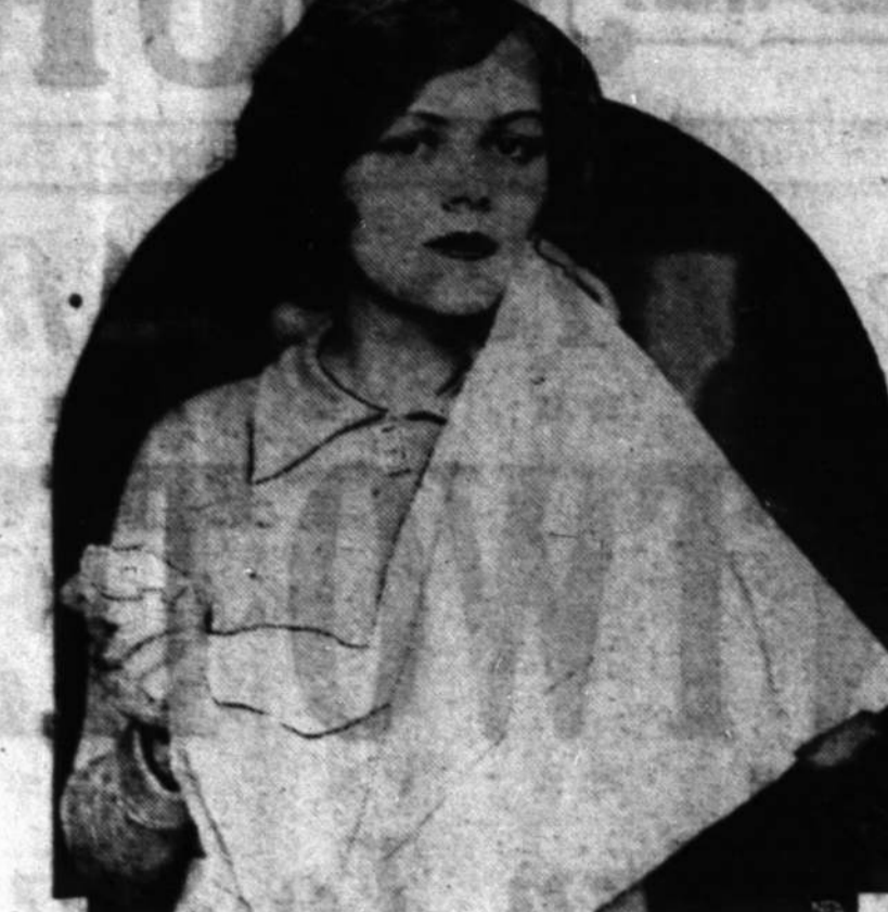
Posed by Yvonne Grey of the Ziegfeld Revue.

CONDITION—A skin that chaps easily or becomes rough with changes of temperature.