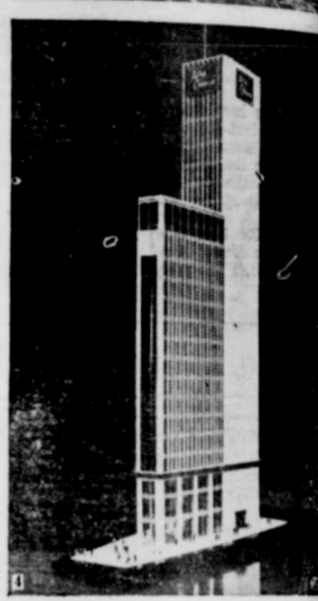
A lot of history has happened in Times Square since its most famous landmark, Times Tower, inched its skyward in 1904. The view (1) looking south along Broadway from 44th Street shows the steel frame being covered with its sheath of terra cotta and pink granite. By the mid-thirties (2) its famed electric news bulletin girdled the building and flashed up-to-the minute headlines; trolley cars still trundled through the Square and a jaywalker could diagonally cross at his own risk. The largest crowd ever assembled (3) along the Great White Way gathered on VJ Day to herald the news of Japan's surrender, August 14, 1945 and the Tower and neighborhood will have a new look (4) when it becomes Allied Chemical's showcase for chemistry, late in 1964, as shown in the architect's model.