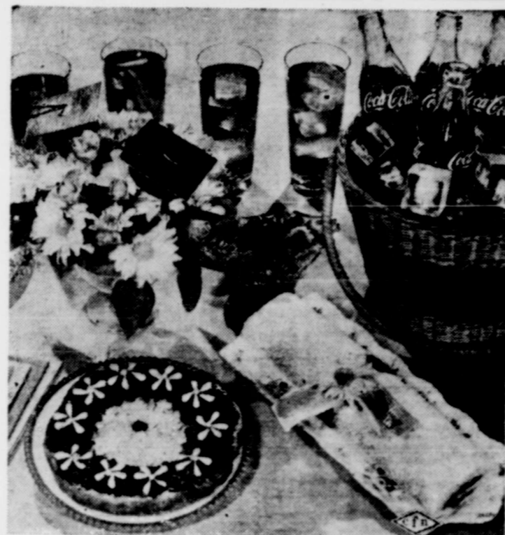
DAISIES and "diplomats" teamed with chilled Cokes are the focal point for this party setting.