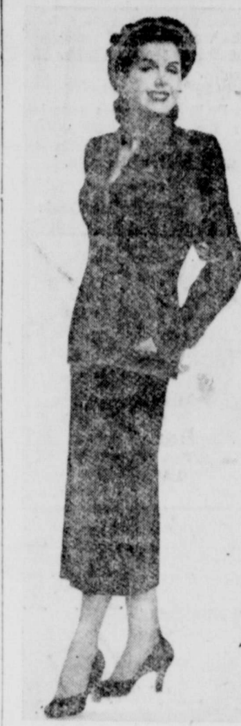
ALL DAY —Actress Ann Miller, in Hollywood, wears a fine black gabardine suit with geometric detail in beige that will see her through the day from morning till night.