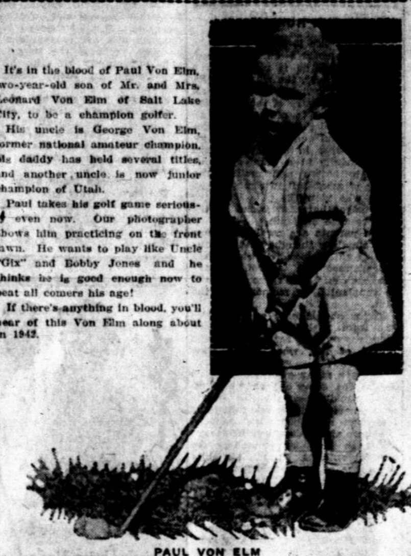
PAUL VON ELM