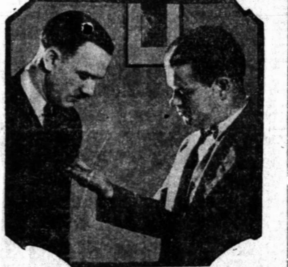
In his outstretched hand Barry Colvin held a ring.

"Yes, repeated O'Day, 'there was hell to pay when Harry and Marie were back.' He fell silent, chewing on the end of his cigar.