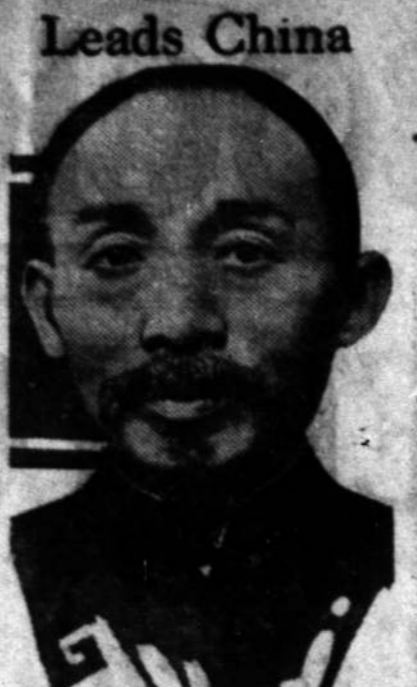
Hou Shih-Ying, one of the most noted jurists in China, has been appointed Chinese prime minister. He comes to office with two world conferences on Chinese affairs being held in Peking.

False pride has one virtue. It may force you to do something of which you can be proud.