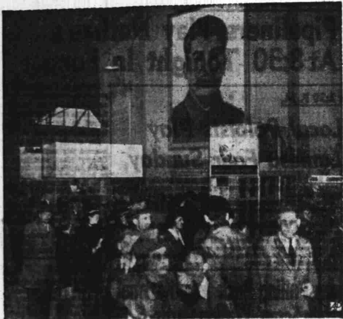
EXHIBIT IN POLAND — A large portrait of Premier Joseph Stalin of Russia over-looks crowd visiting the Soviet exhibition building during fair at Poznan, Poland.