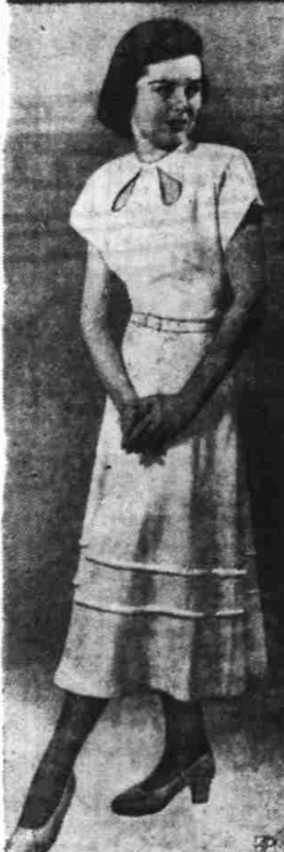
DOUBLE DUTY... Sleek white shanting for graduation and summer dates.