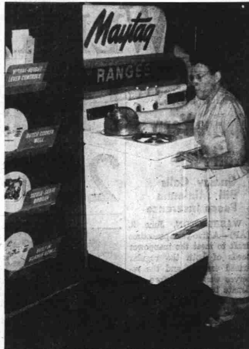
MODERN MARVEL is the Maytag Dutch oven range in any kitchen. Sturdy, automatic, beautiful and efficient, the range is the answer to wife's culinary prayers. The new model may be seen at Big Spring Hardware.

A complete "play department" at the Westex Service Store, 112 West Second street, is attracting children and grown-ups alike who demand the best quality in recreation materials. The firm has a large stock of items such as tennis and baseball supplies, and maintains an attractive display of toys, including bicycles and tricycles.