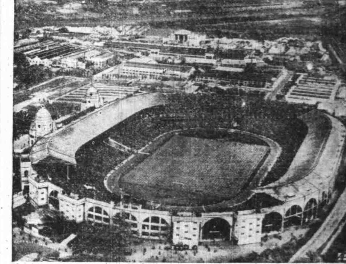
1948 OLYMPIC'S SITE — London's Wembley Stadium, where this year's Olympic games will be held, is jammed with 90,000 spectators watching a soccer game.

Five other defendants convicted at the trial, which ended last August, were sentenced to life imprisonment. Four received lesser prison terms. Seven of the 23 original defendants were acquitted.