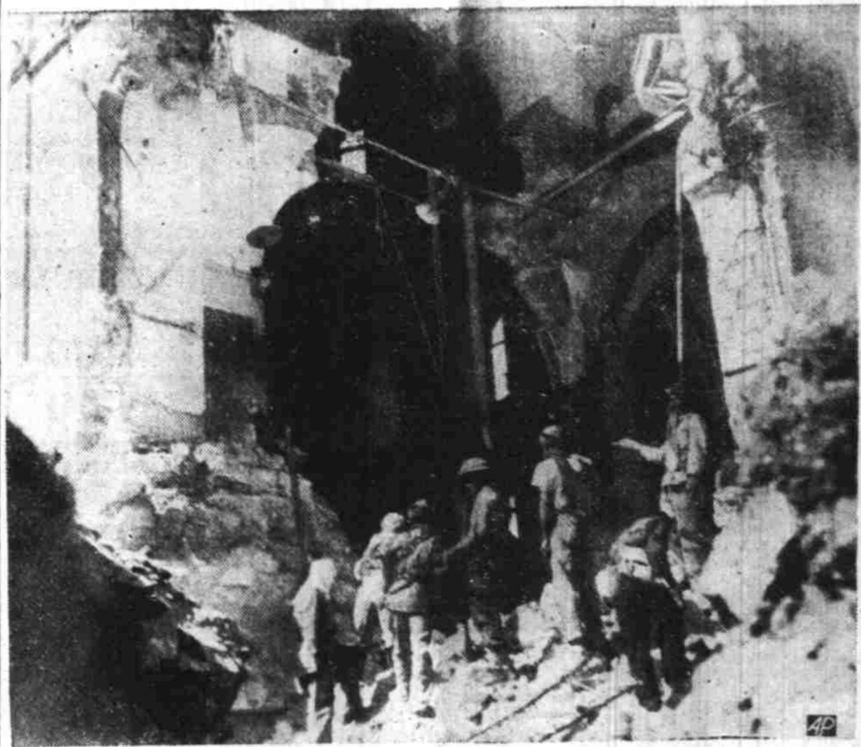
ARABS ENTER HAGANAH FORTRESS—Arab fighters pick their way through the rubble of Tiferet Synagogue, tallest in the Jewish quarter of the Old City of Jerusalem, May 21, after Arab demolition squads had blasted holes in the building which was being used as a fortress by Haganah forces.