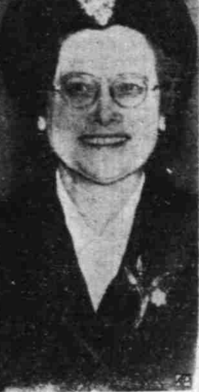
FIRST WOMAN SPEAKER — Mrs. Florence Paton (above), member of Parliament for Nottingham, became the first of her sex to take the speaker's chair in Britain's House of Commons, May 31, when she acted for Colonel Clifton Brown, Speaker of the House.

LONDON, June 3. (AP)—Responsible diplomatic officials reported today the Western powers plan to seek an accord with Russia soon on establishment of a sound, uniform currency throughout Germany for use in domestic and international trade. No details were disclosed. Chances for success of the move were seen in the fact both Russia and the Western powers have argued the need for a uniform currency. Agreement to make a new effort in this direction was reached in a conference of six countries which ended here yesterday. The countries—the United States, France, Great Britain, Belgium, The Netherlands and Luxembourg—charted plans for Western Germany's political and economic future. The Russians recently blamed the Western powers—the U. S. in particular—for the breakdown of four-power Berlin talks on German financial reform. Both the U. S. and Britain denied the charge. In recent weeks, both British Foreign Secretary Ernest Bevin and Gen. Lucius D. Clay, U. S. military governor for Germany, have expressed hopes for a new countrywide currency system.