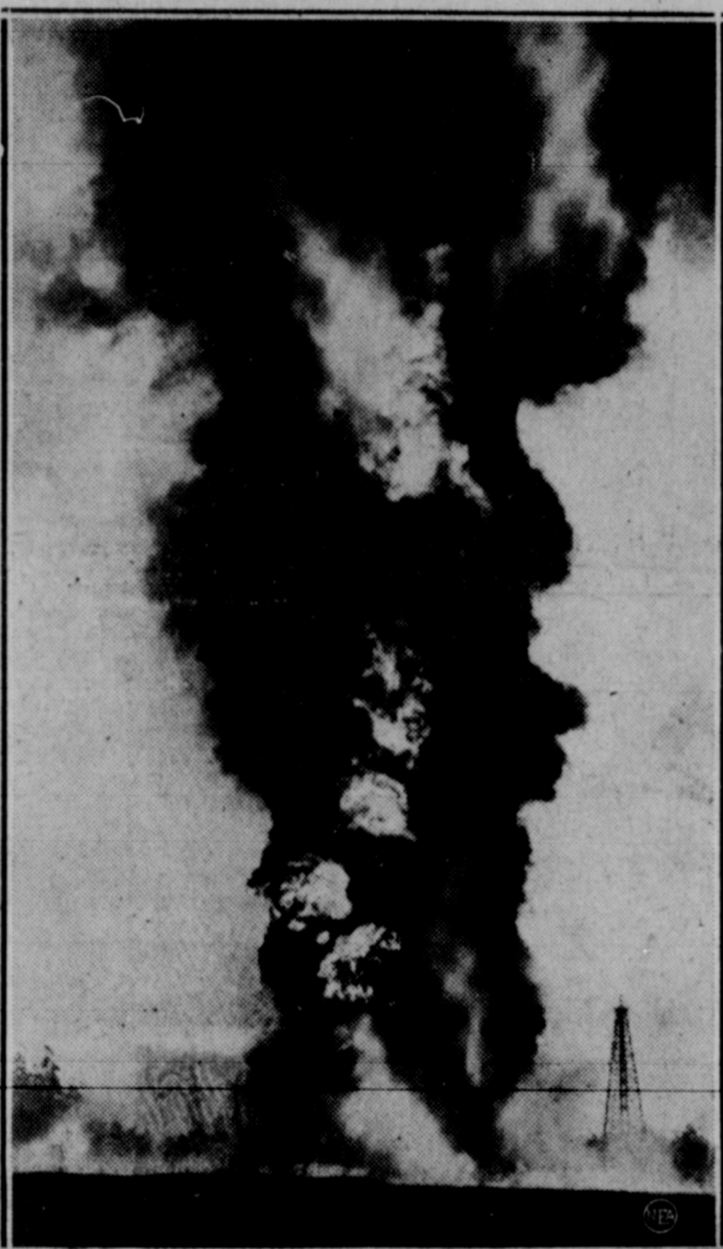
Pillars of smoke shot through with sheets of flame spouted from this oil well three days after it blew in as a big producer near Trinity, Houston county, Tex. Fire crews fought vainly for more than a week to control the roaring blaze, which took a heavy toll.