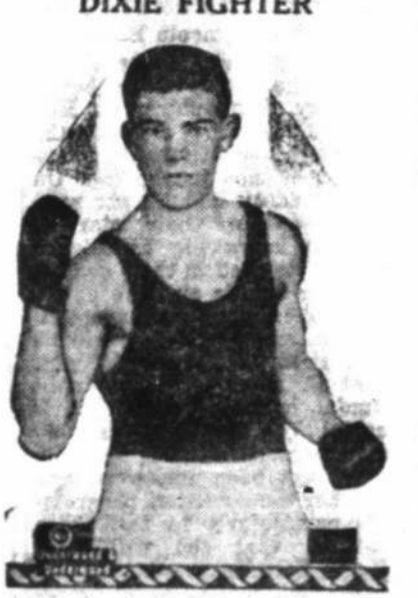
Here is a typical fighting pose of Young Stribling, of Georgia, who has been signed to fight Jimmy Slattery in Madison Square garden on March 26.

By United News FORT WORTH, Feb. 26.—One of the thrilling stunts that Nick Carter imagined, was acted out by real characters with real motives and real guns and a real heroine Friday morning at Aledo, 18 miles from here.