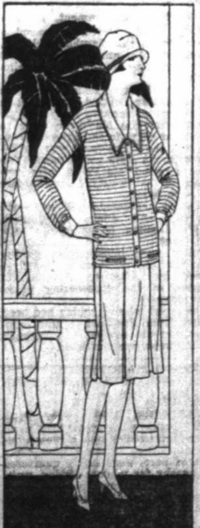
Fashions Combined Fabrics Effectively

When winter resort tournaments are a memory. A blouse of striped silk jersey and a skirt of white flannel or white crepe make a smart outfit for the woman who indulges in sports. Equally well is such an outfit liked by the woman who enjoys athletics passively. The entente between the two garments is effected by trimming the blouse with the skirt material. Two and one-quarter yards of 40-inch crepe are needed for the skirt, which is attached to a long-waisted underbody, and 2 yards of silk jersey for the blouse. That the home dressmaker may make the sleeves with the smart effect pictured, an illustration is given of the correct way to finish the cuffs. The slash in the sleeve is finished with an extension facing. The sleeve is then sewed to the cuff, the raw edge being folded down over the seam to conceal it completely. The continuous placket may be held together with a hook and eye or buttons and buttonholes, preferably the latter. There is also attached down the center of the front of the blouse a narrow fold of the skirt material to