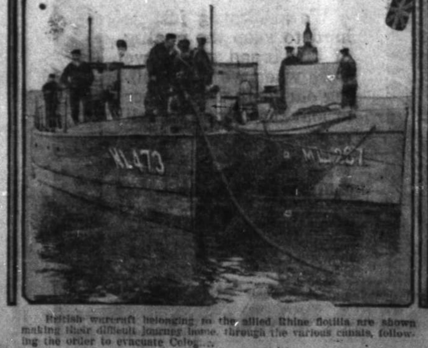
British warcraft belonging to the allied Rhine flotilla are shown making their difficult journey home, through the various canals, following the order to evacuate Cologne.