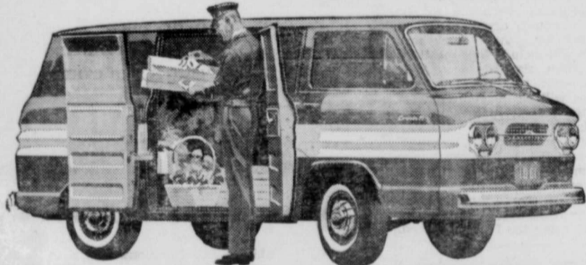
CORVAIR—Side doors open a full 49" wide. Loading height is a low 14" high!

A panel and two pickups that put a thrifty air-cooled engine in the rear, the driver up front and as much as 1,900 pounds of load space in between! That's more capacity than a conventional half-tonner. Yet these Corvaire 95's are nearly two feet shorter from bumper to bumper. Highly maneuverable. Built to last and bound to save on a busy schedule!