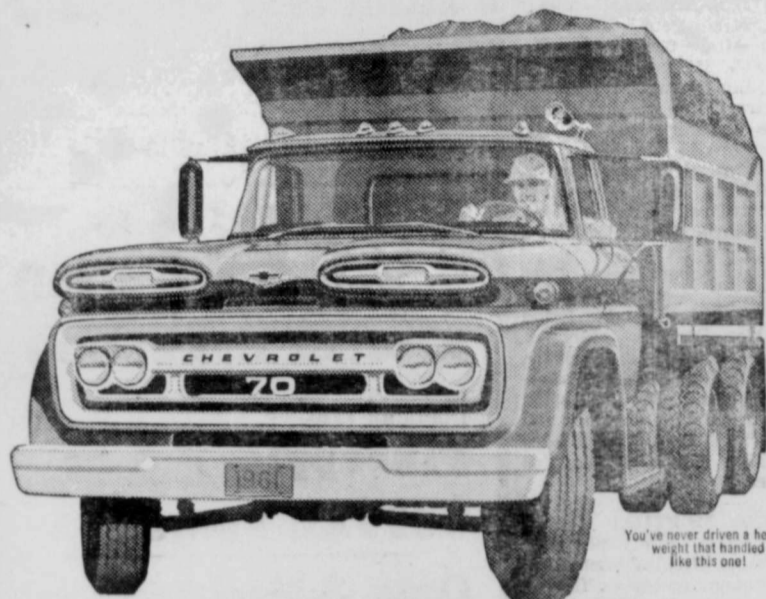
You've never driven a heavy-weight that handled like this one!