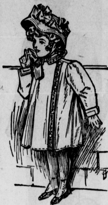
A PRACTICAL GARMENT.

Here is shown one of those attractive little coats which closes at the side in real Russian manner and covers the small wearer so completely that it is most practical for wear. The materials suitable to such a wrap are many.