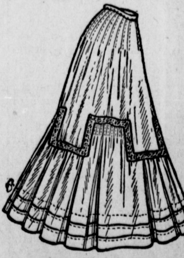
TUCKED FLOUNCE SKIRT.

The skirt with straight edges is the one that is always most in demand for washable materials. It does not stretch in laundering, and it keeps its shape as no other can be trusted to do. Here is a distinctly novel model that is so made and that is so adapted to the