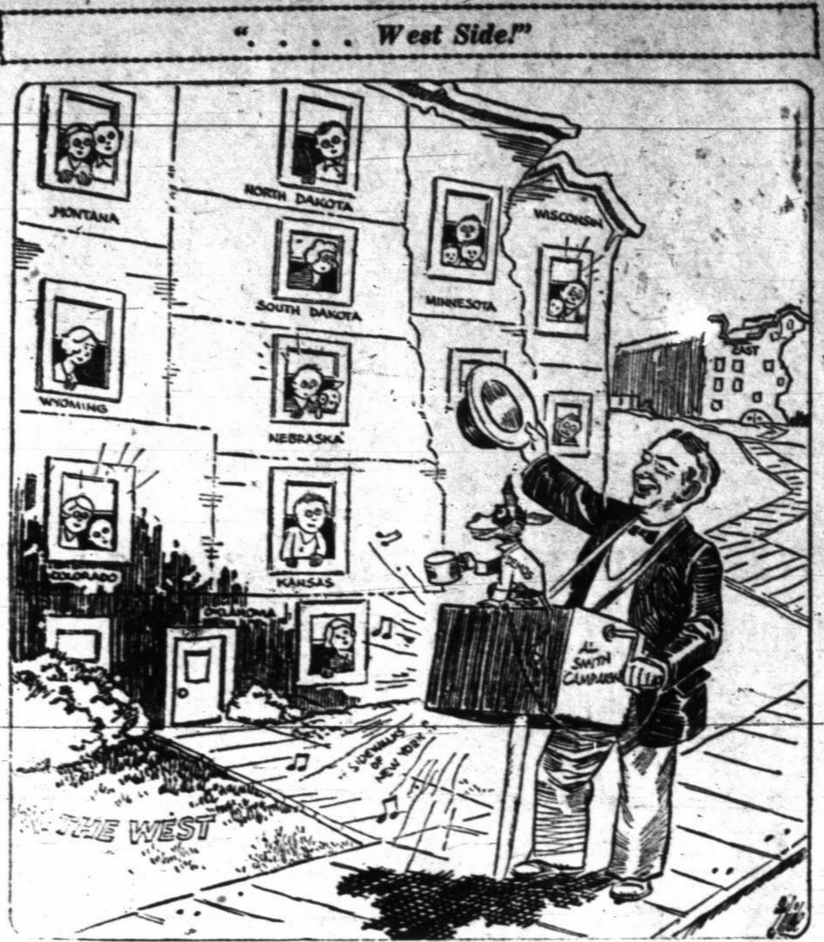
Without-Or-With, Offense To Friends Or Foes, We Sketch Your World Exactly As It Goes—Byron

The Plainsman believes in the liberal right of the voter to make his own choice. This column has never been and will never be a department of political propaganda for any candidate for in this writer's opinion, such is not the function of a newspaper.