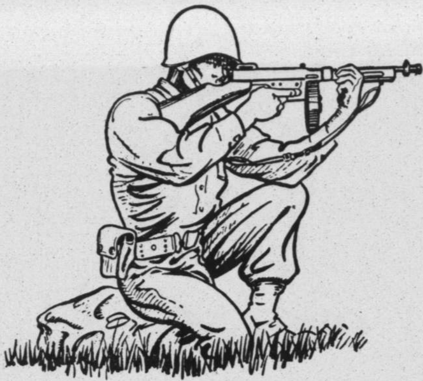
HOT WORK AT SHORT RANGE —The Thompson ("Tommy") sub-machine gun in the hands of a trained infantryman offers a formidable combination which can spell the difference in fire-power when American troops clash with those of the enemy.