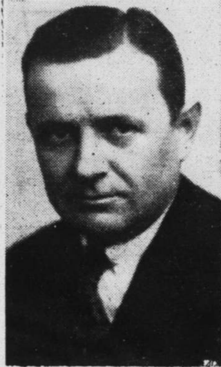
James V. Allred, who resigned as federal judge to run for the United States Senate, has formally made application for a place on the Democratic primary ballot. He gave his age as 43; occupation, attorney; residence, Bellaire, Harris County.