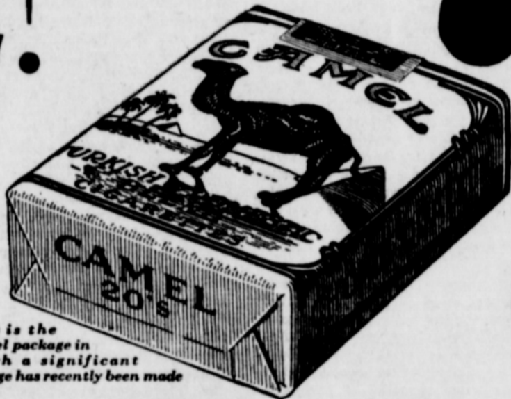
This is the Camel package in which a significant change has recently been made