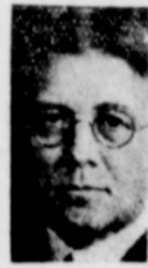
Postmaster Gen. Brown

For almost a year Mr. Legge's service has been directed toward stabilizing the wheat market. Opposition arose in Washington and in parts of the grain belt to the purchasing by the government of millions of bushels of surplus wheat to steady the market and maintain prices.