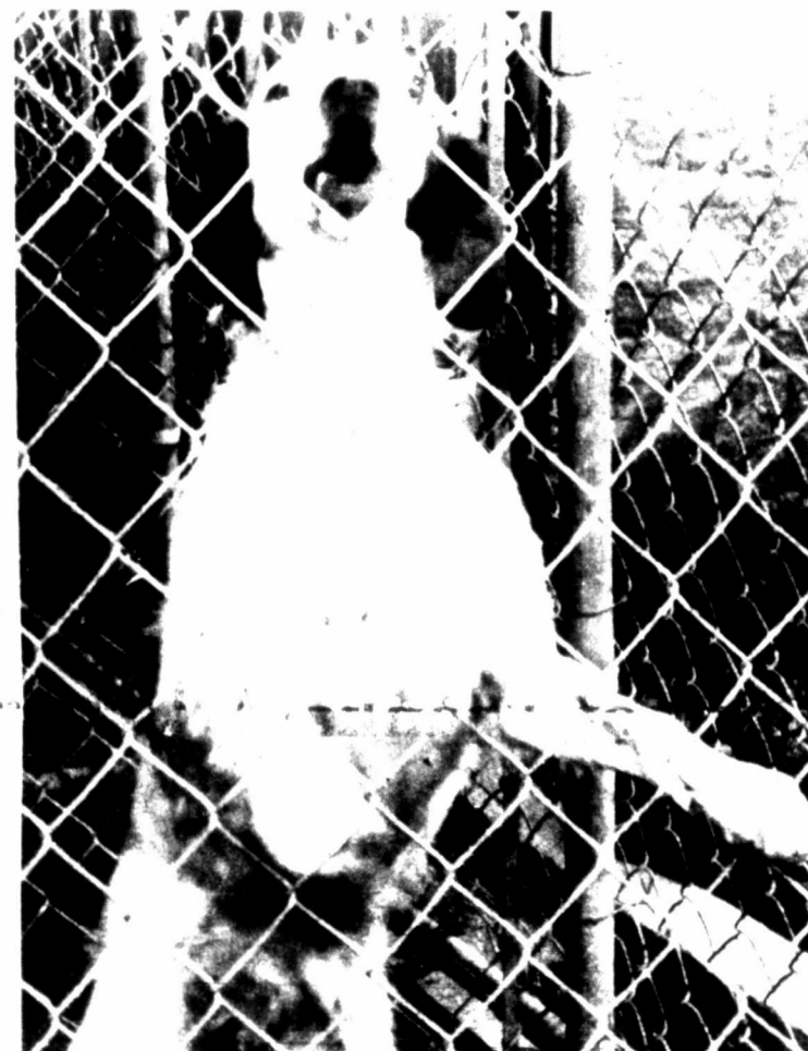
POUND PUPPY - Liz, a young female orange and white Brittany, is available for adoption from the city pound located at Mitchell County Veterinary Hospital, Highway 208 south. For more information about her or other pets available for adoption, call 728-8055.

Soup and Salad Tasting Spree - Thompson Room, Feb. 14, 5-7:30 p.m. Tickets $4. For more information, call the Wallace Center, 728-2392.