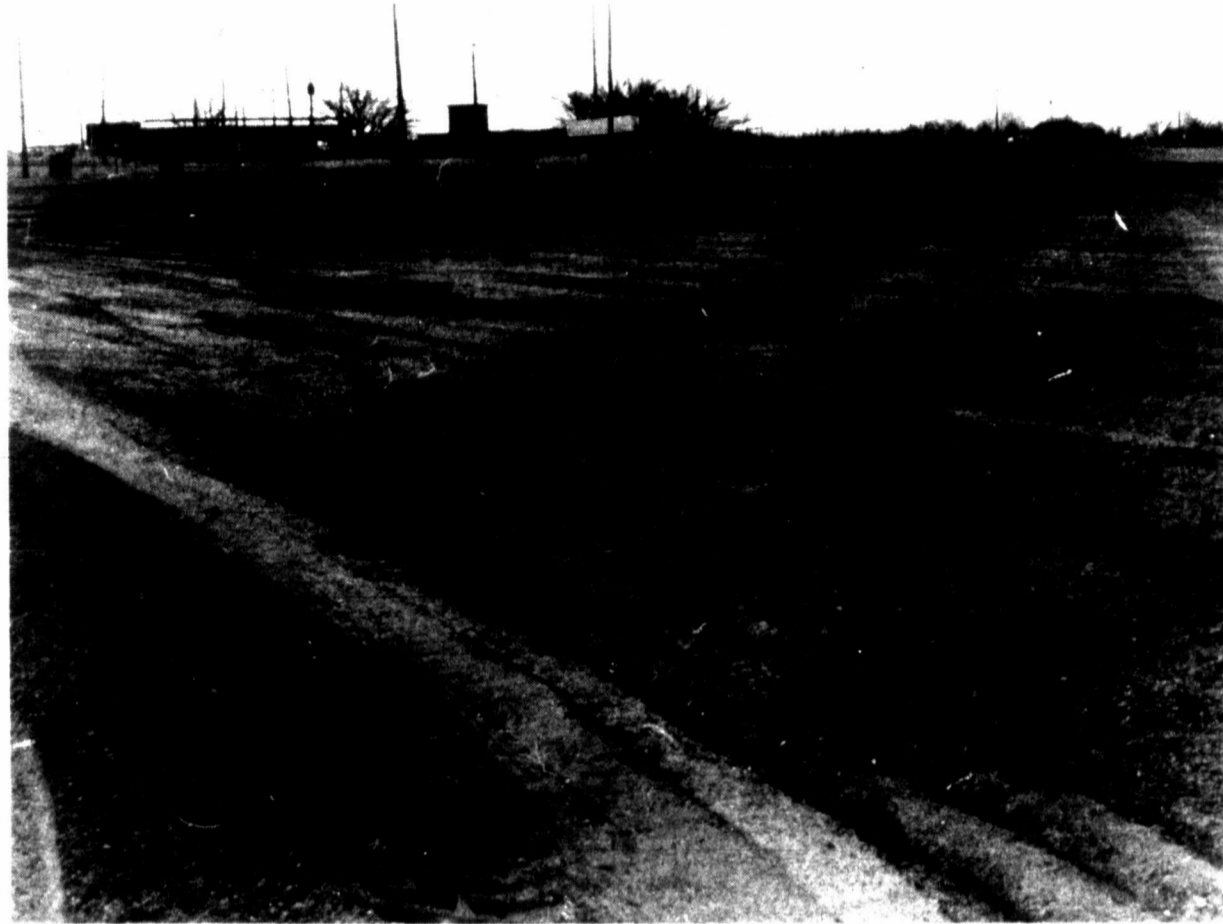
NEW LITTLE LEAGUE FIELD PLANNED—City crews have cleared and leveled some rough terrain, just north of the present Little League field in Ruddick Park, where a new baseball field is to be built to accommodate both little league and teenage play.