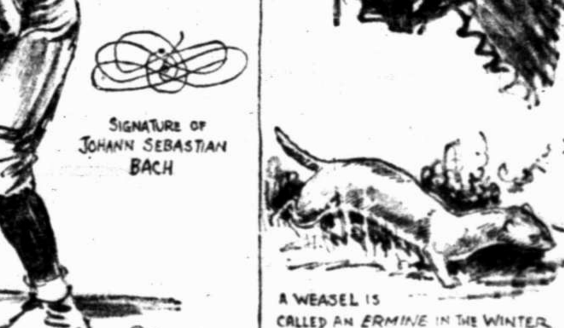
SIGNATURE OF JOHANN SEBASTIAN BACH