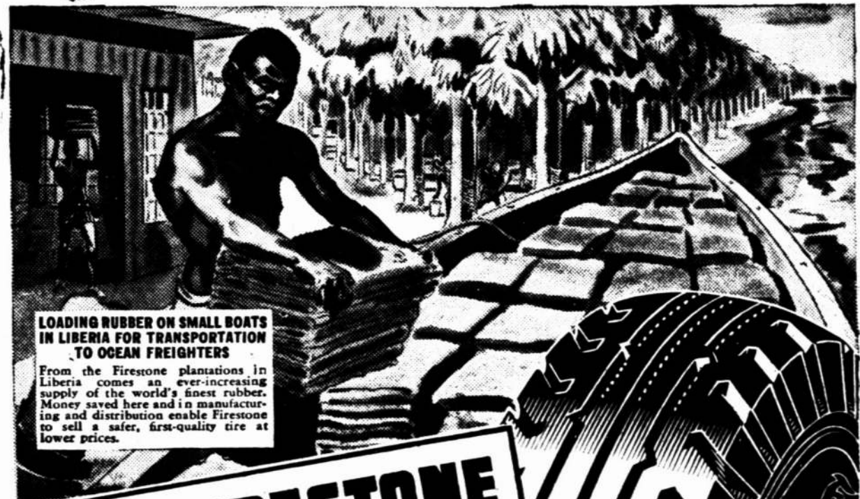
LOADING RUBBER ON SMALL BOATS IN LIBERIA FOR TRANSPORTATION TO OCEAN FREIGHTERS

ELMO SMITH, Owner Located on Big Spring Highway