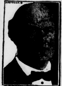
WILLIAM J. BRYAN

Don't forget the Fair Committee meeting on the Court House Lawn at 2 p. m. Saturday of this week.