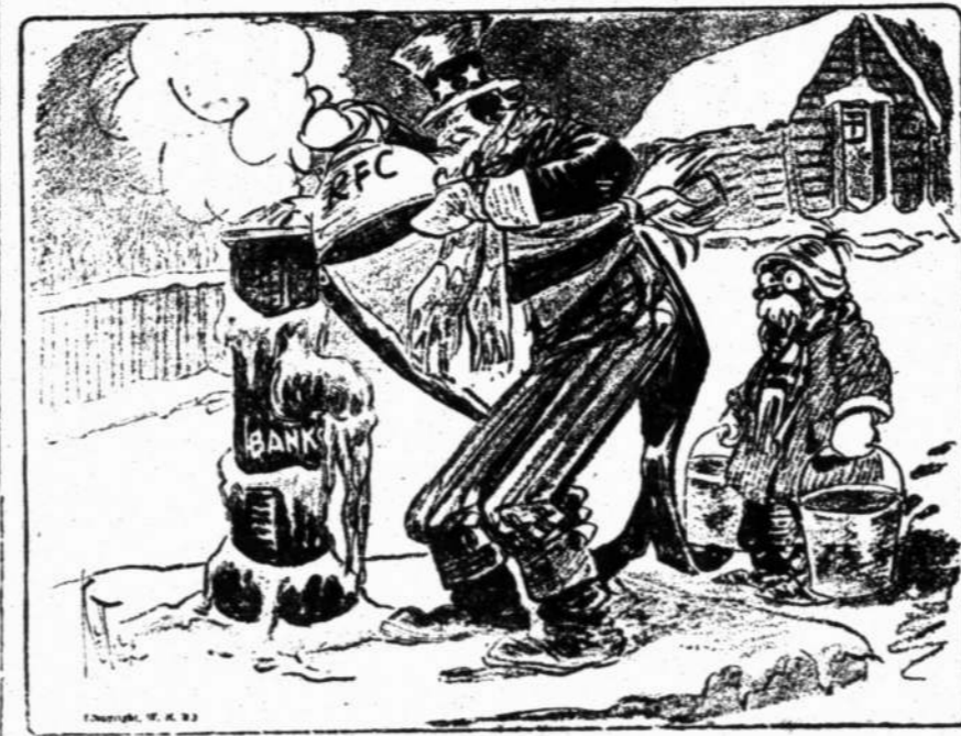
Next Week Beginning January 15