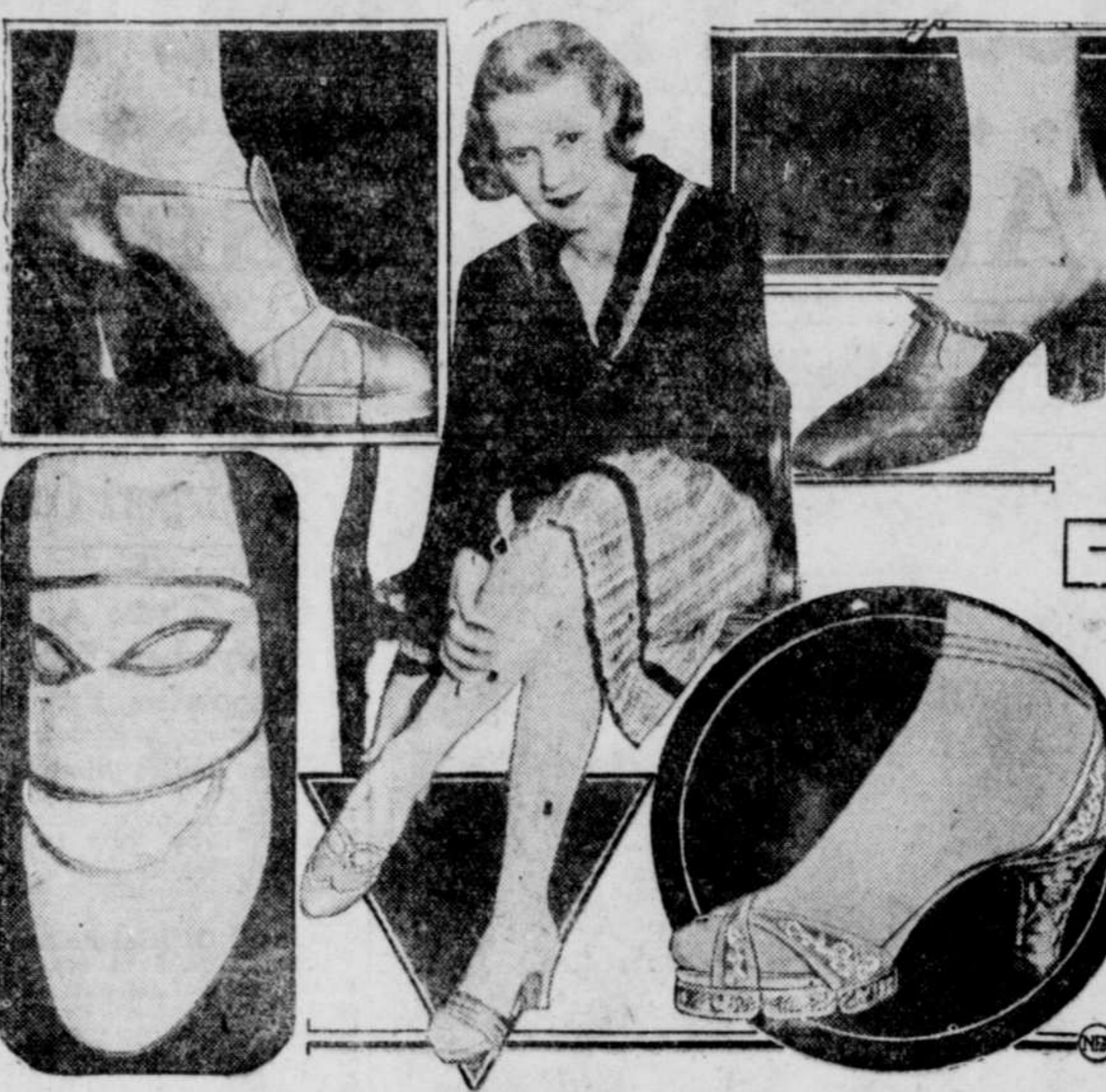
Svelt, exquisitely designed and beautiful in color and cut are the new spring shoes. (Upper left) The Lid is a lavender blue satin T-strap sandal, with new half-inch sole. (Lower) The "Mask," in apple green suede, seems to have eyes and a mouth outlined in gold. (Center) For correct street wear, Milady may wear a "mystic" pump. (Upper right) The golden mules for boulevard wear, with a square toe and heel. (Lower) The season's finest confection, a delectable pastel green dance slipper, with sculptured silver wood half-inch sole and heel and appliqued suede flowers on the kid straps.