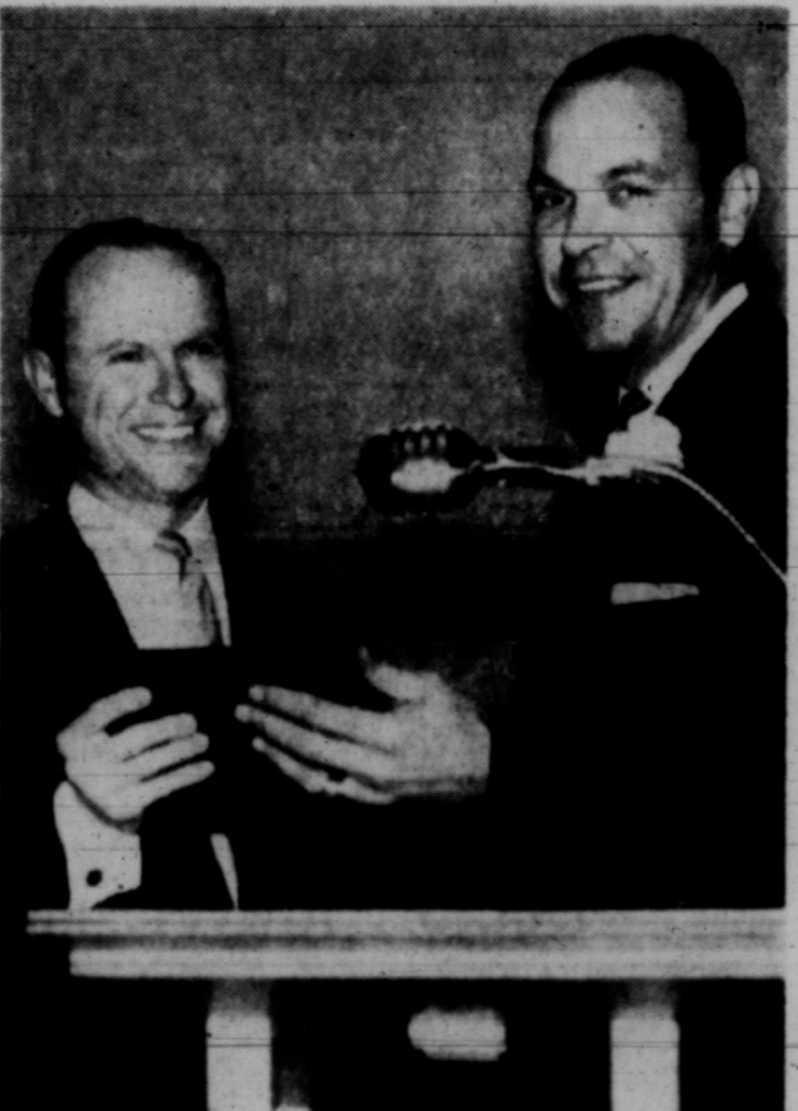
Smiles Over Award

Industrial Team program will work. The director and his committee assigned to taxes will compile data concerning ad valorem and special tax rates pertaining to all property within the city, county, districts and state. Experiences of other industry and business relating to taxes will be noticed and recorded. There will be a look into the future, too, to chart the relationship of bonded indebtedness, city, county and districts to the future tax burden of industry and business. In addition, the tax project will gather pertinent information about the tax conditions here compared (favorably or unfavorably) with other areas and states. This will include not only property ad valorem taxes, but income, sales, gross production and other type taxes. The Industrial Team plan, of course, will be geared in close cooperation with the Chamber of Commerce and the Chamber's Industrial committee, which suggested and sponsored the organization of Team Inc.