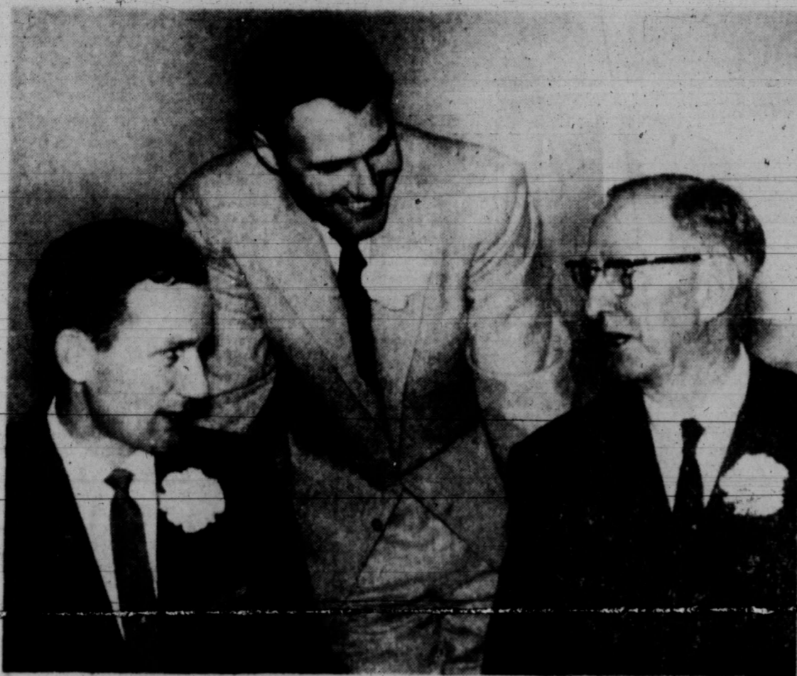
Speaker Spins a Yarn

$5 Per Year in Mitchell County — 10c Per Single Copy