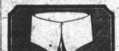
CLARION 2 1/2 in. LENOX 2 1/2 in. Two heights in the new