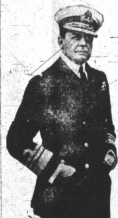
ADMIRAL SIR DAVID BEATTY

The promotion of Vice Admiral Sir David Beatty to the command of the British grand fleet in the North sea has met with almost unanimous approval in Great Britain. The London Morning Post said: "It has fallen to Sir David to take part in more fighting than any other admiral during the war, and upon every occasion he has unambiguously manifested those inestimable qualities which are so seldom found united in one man—a swift intuition, rapid decision, resolute and daring action, in a word, Vice Admiral Beatty is a second Nelson. Beatty has won his reputation while he is still young—a happy fate—and equally happy is he in that he has earned it by brilliant achievement. There are many ways of gaining popular acclaim, but there is only one which stands the test of time and circumstance, and it is Beatty's way." Beatty commanded the battle cruiser squadron which began the Jutland fight. He is forty-five years old and is married to a daughter of the late Marshall Field of Chicago.