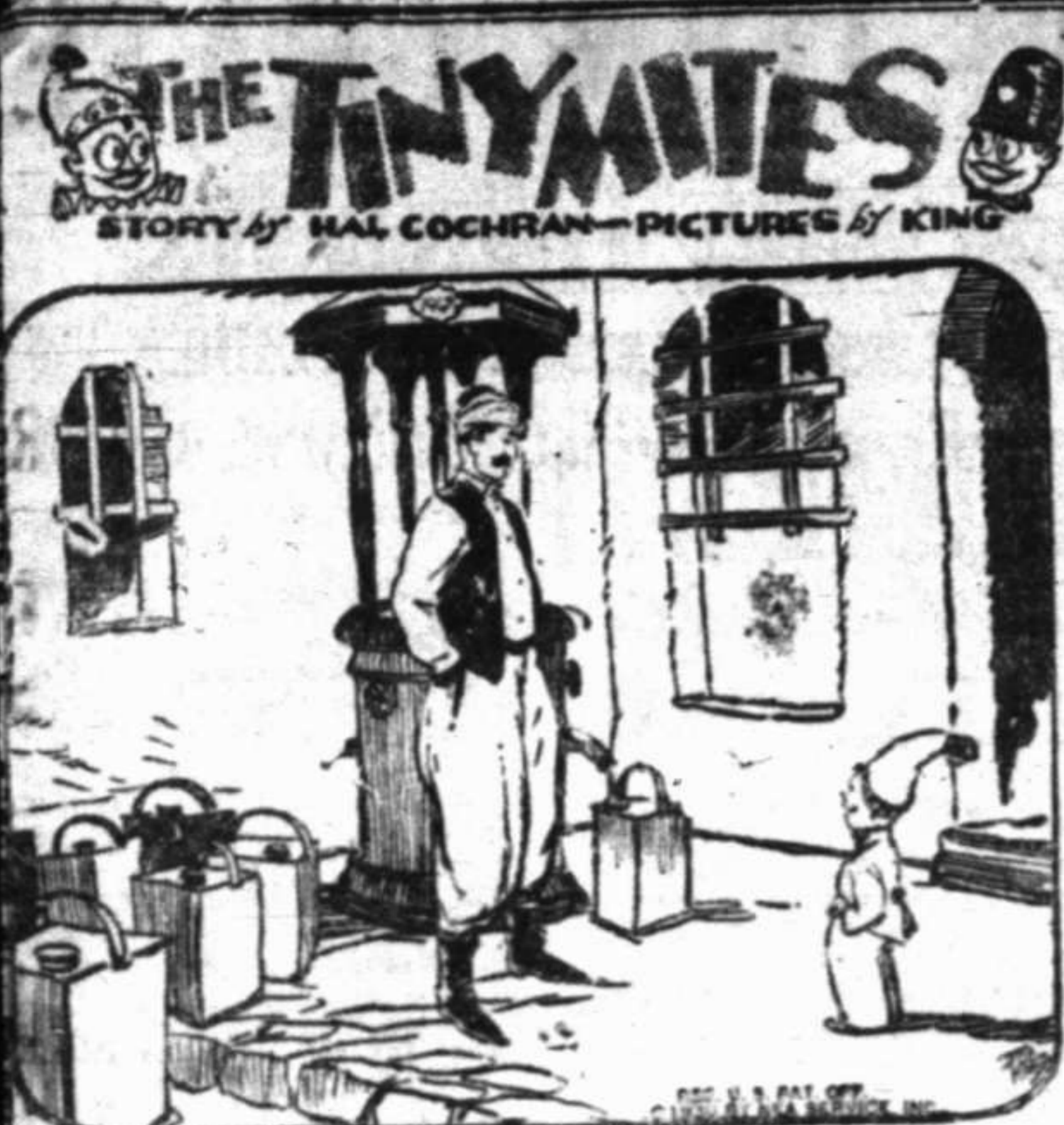
READ THE STORY, THEN COLOR THE PICTURE