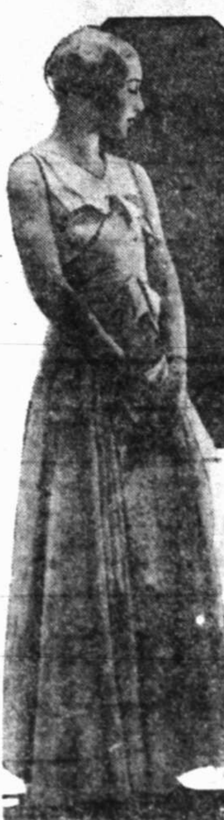
By MME. LISBETH

Taffeta is the entrancing gown combining punk and blue taffeta from Marcial et Armand. Taffeta must perfume by the nature of the material, be untrimmed, except in the very exceptional cases and where self-trim is simply used. The latter is the case with this frock.