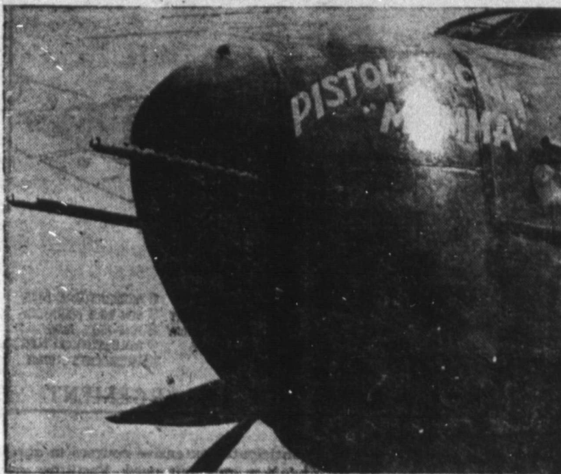
"Pistol Packin' Momma" in the form of a North American B-25 Mitchell bomber equipped with a 75 millimeter cannon, is a smash hit in the Southwest Pacific, where this plane and others like it have recently been hitting the enemy with the "flying artillery." A War Department announcement has revealed that the North American Mitchell is the first plane to be equipped with heavy artillery and has been a great success in smashing Japanese shipping and supply centers.