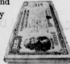
If they're lost, stolen, or destroyed, we replace 'em.

Now doesn't that sound like easy handiwork?