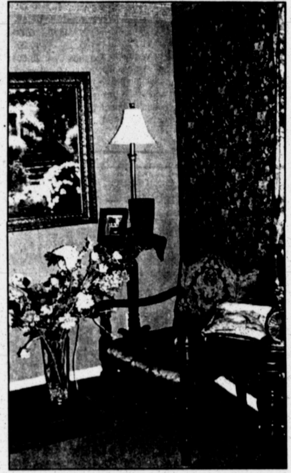
Fresh flowers provide an added feature to a beautifully designed nook for Avenues' customers.