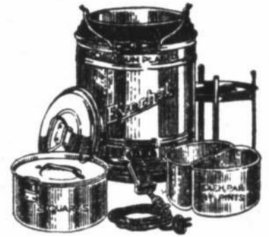
JUG TYPE COOKERS

A few pennies is all it costs to cook a complete meal in a NESCO Roastmaster. You can cook everything in it that you cook in an oven—and better. See these automatic electric cookers at our store, or at your electrical dealer's.