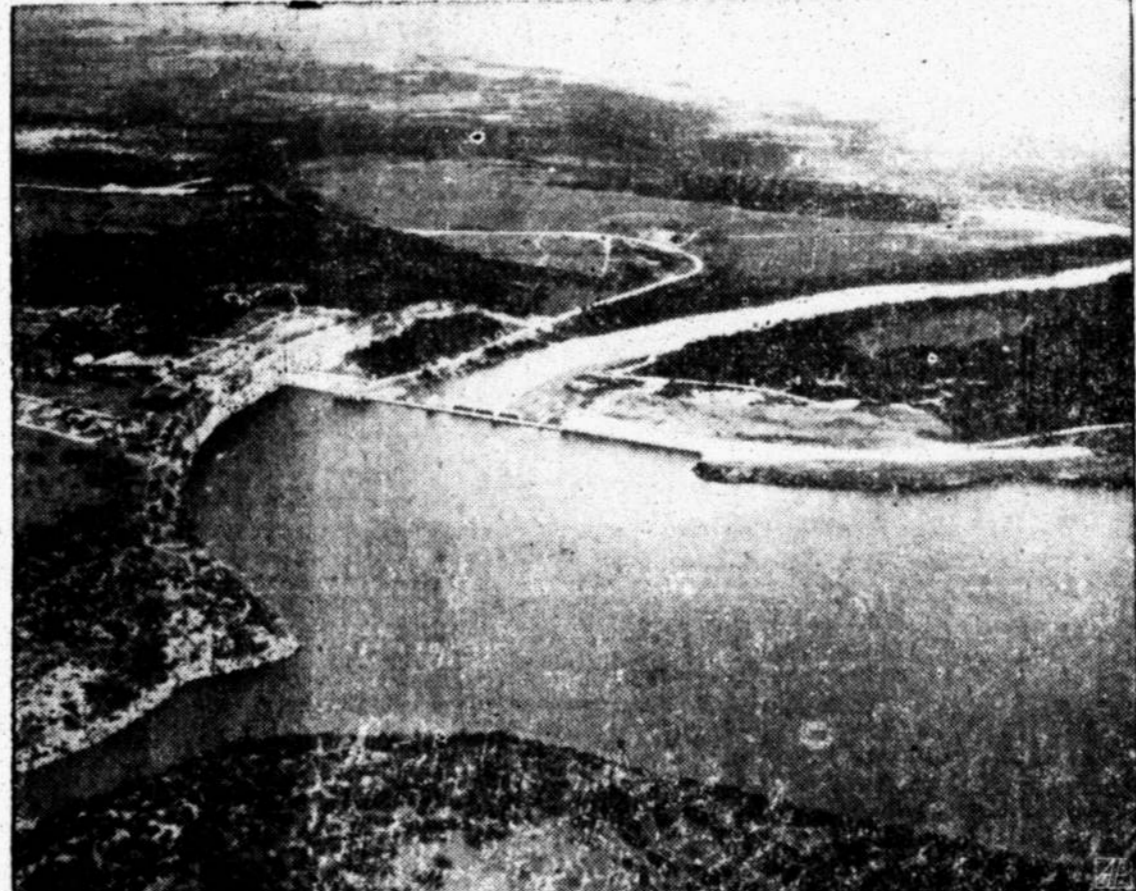
Possum Kingdom Dam on the Brazos River near Mineral Wells, recently completed, completed another great lake in North Texas. Covering hundreds of acres, water at the dam proper is more than 100 feet deep. Thirteen flood gates control its level.