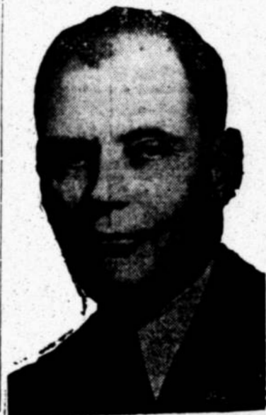
COKE E. STEVENSON