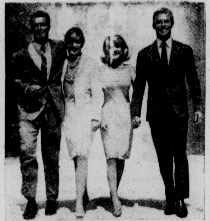
Two Romantic Teams

Colorado City Record, Thursday, Dec. 29, 1966, Page 2