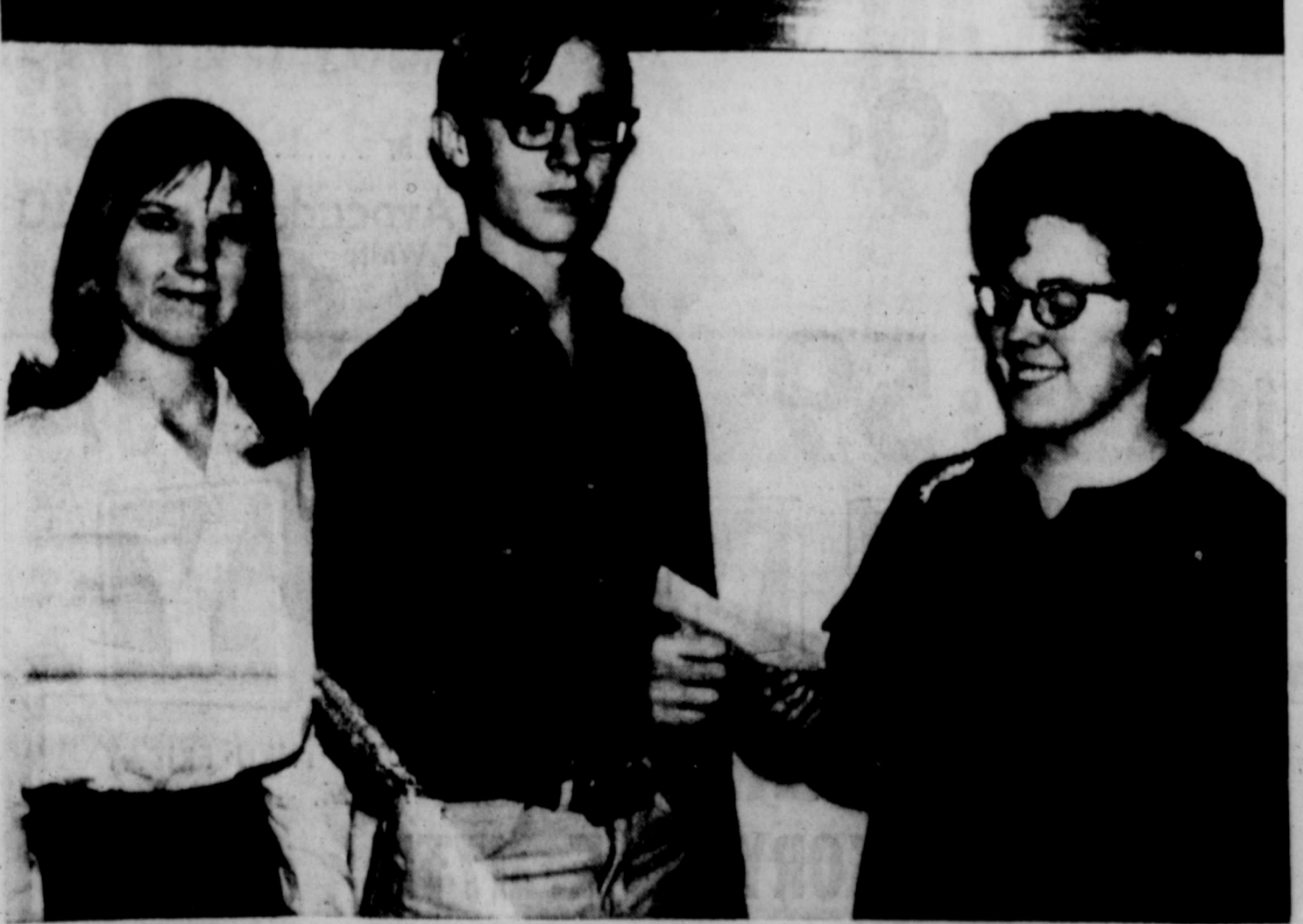
American Essay Contest Winners