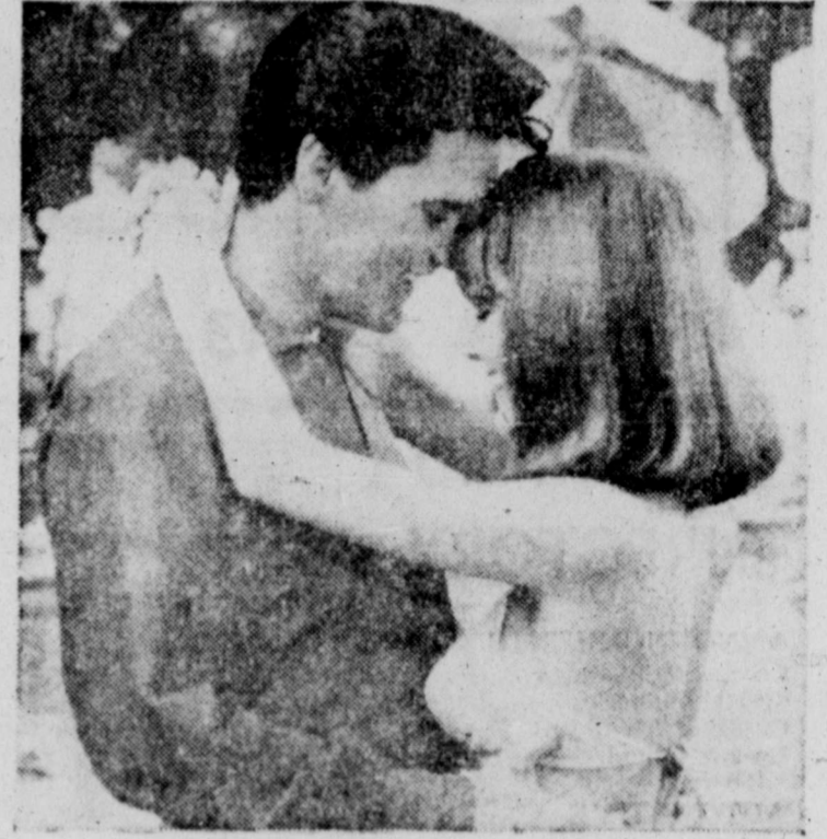
New Year's Eve Movie

Gun handling discipline does not start and end in the woods. It should be ever present!