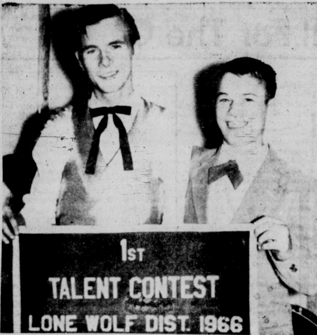
1st TALENT CONTEST LONE WOLF DIST. 1966