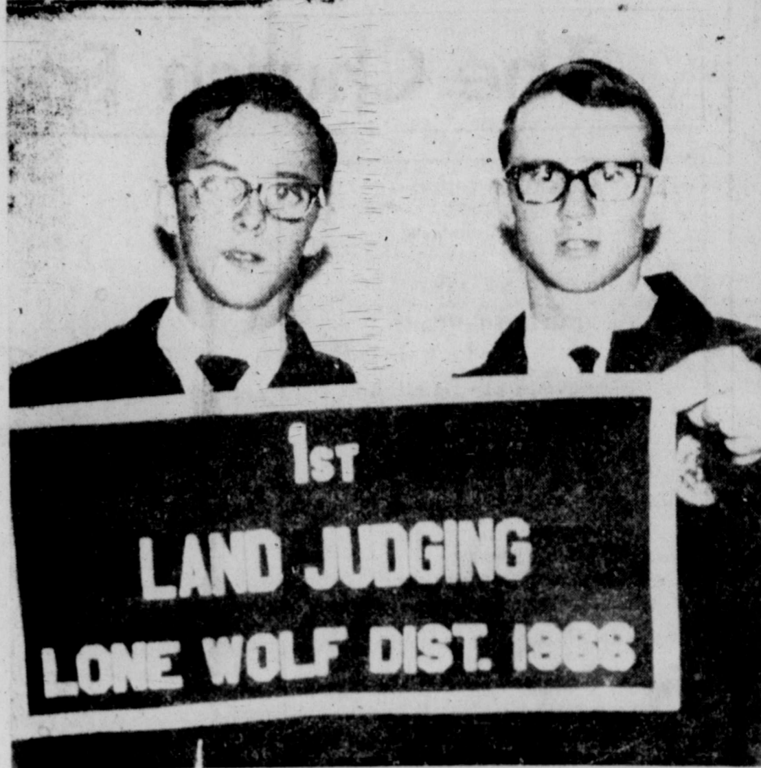
1st LAND JUDGING LONE WOLF DIST. 1966