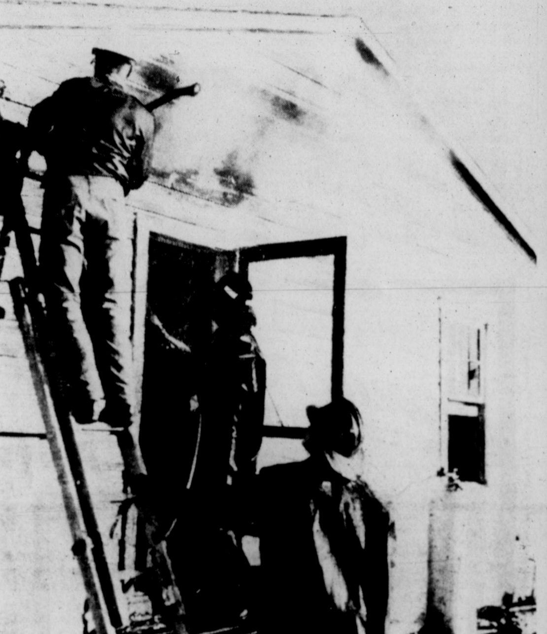
Firemen Battle Blaze

a tourist attraction, developing manmade and natural attractions, the care and feeding of tourists, use of brochures in attracting and developing tourism and other related subjects will be discussed in the day-long meeting. The Colorado City conference was scheduled for chambers of commerce and other organizations from all over West Texas following "brainstorming" sessions by hundreds of businessmen during recent months. These sessions, conducted in numerous cities, developed a consensus of opinion that tourist development is the greatest potential for growth in West Texas.