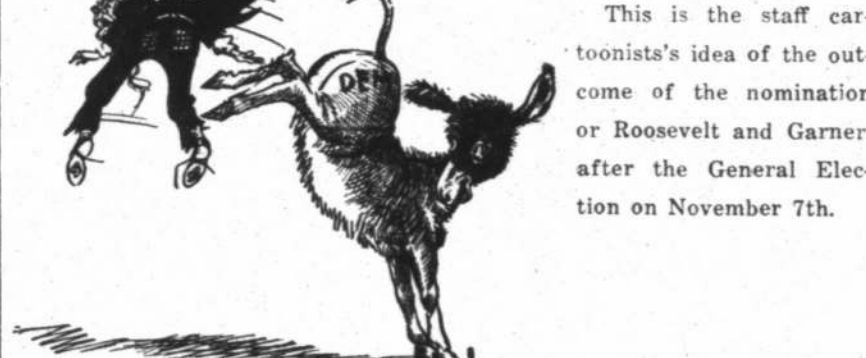
This is the staff cartoonists' idea of the outcome of the nomination or Roosevelt and Garner, after the General Election on November 7th.

John N. Garner, a native son of Texas, now speaker of the House in the present Congress, will be burdened with the big share of Democratic National Campaign, due to the physical affliction of the presidential nominee, but Garner is an able standard bearer and will be responsible for amassing many votes for he and his co-partner.