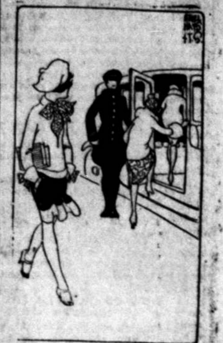
Fly paper doesn't draw as many flies as limousines draw friends.