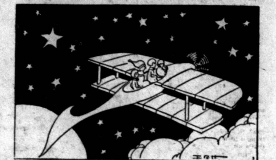
Away they went—bzzzz!—like a great bee.

Away they went—bzzzz!—like a great bee, for moon airplanes make even more noise than earth ones.