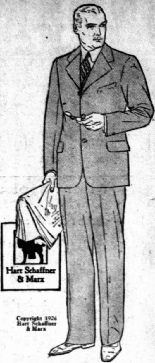
Copyright 1926 Hart Schaffner & Marx