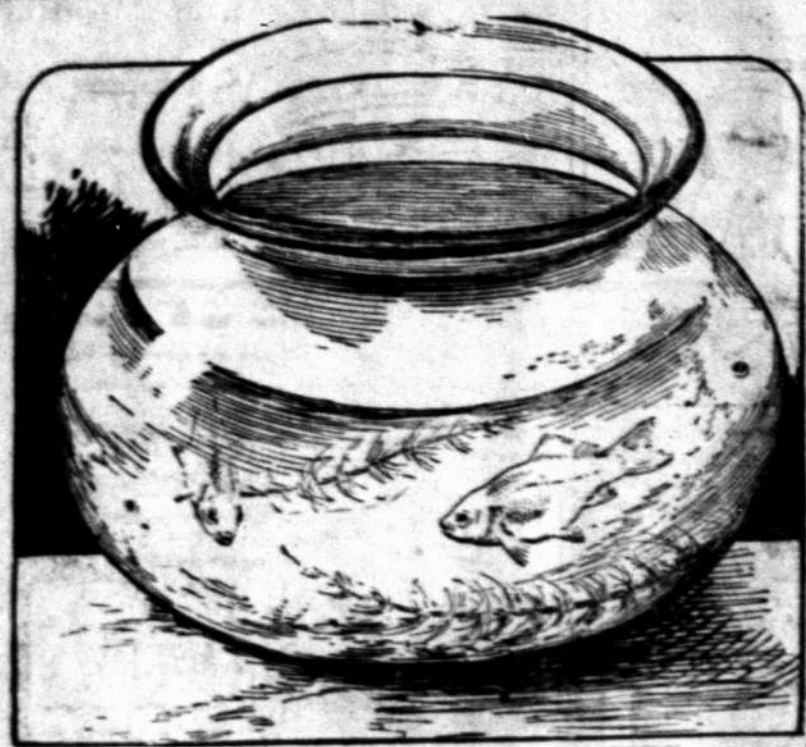
HOW TO KEEP GOLDFISH HAPPY

I have kept goldfish alive and perfectly happy for two and three years without once changing the water except by adding a little now and then to keep it at the required level, and