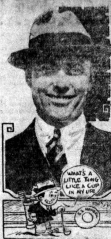
CHICK EVANS

This famous exponent of the mashie and niblick can still flash his usual Evans smile, despite the recent setback he encountered in the British amateur golf championship.