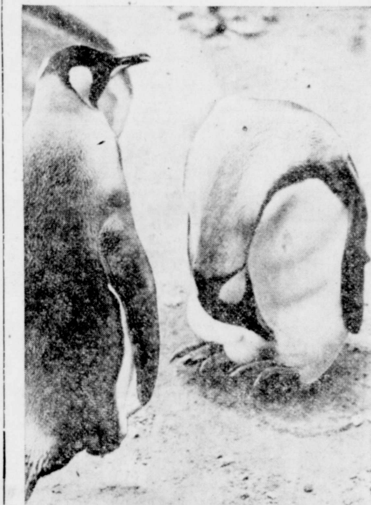
MAKING TURNS—Mary and Tubby, King penguins at the London, England, Zoo, are taking turns in hatching the egg they created. Right now papa is taking his turn sitting on the future heir, anxiously tucking it in a little more. Mama stands nervously by, for baby will be the first penguin hatched in London.

A plane from Abilene will fly over Cisco sometime Saturday and drop pamphlets advertising the air show scheduled in that city for Sunday, Sept. 18. Officials of the show wrote for permission to drop the advertising and the request was granted by Mayor Rosenthal.