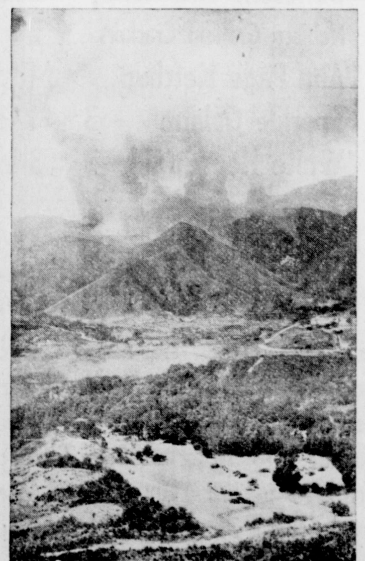
MARINES TO THE RESCUE—Fire fighters and equipment rendezvous in a clearing near Camp Pendleton, Calif., preparing to fight forest fires in the Santa Ana Mountains. August timber losses from fires in National Forests in Montana, South Dakota and California may total 100,000,000 board feet.