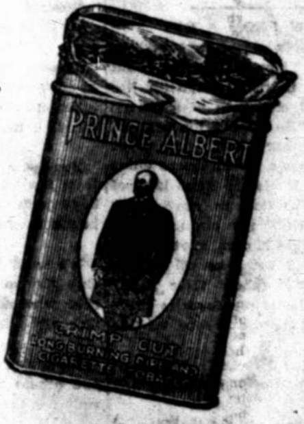
P. A. is sold everywhere in tidy red tins and tippy red bags. And always with every bit of bite and parch removed by the Prince Albert process.

Get yourself a tidy red tin or a tippy red bag of Prince Albert today and get going with some grand, home-rolled cigarettes. Then—if you like a pipe—try a load of this same wonderful tobacco. Any way you smoke it, P. A. will give you more pleasure to the cubic inch than you ever thought possible.