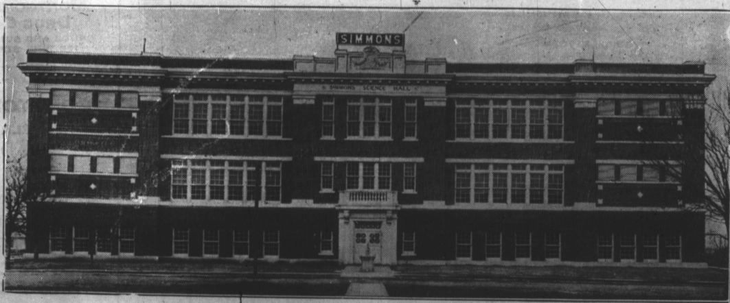
SIMMONS SCIENCE HALL

The Science Hall, one of the most modern in the South, and one of the best equipped in the state, was completed and opened in 1920. This building was especially designed for the Sciences, arranged by departments, each having laboratories and a lecture room of elevated seats, these rooms wired for stereopticon.