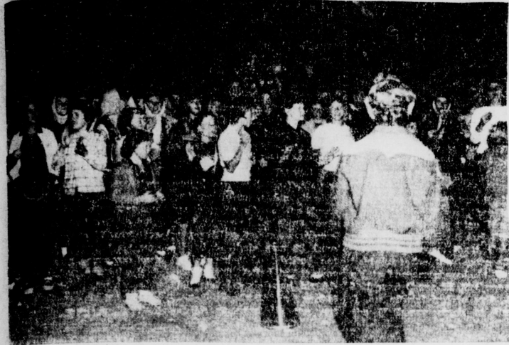
A BONFIRE WAS SO DESIRED (ALSO, TWICE FIRED)

Students of Crane High are shown above getting fired up at the bonfire Thursday night, November 13. The spirit generated must have helped because Crane came through to win the game 50-12 which is the largest margin Crane has ever enjoyed over McCamey.