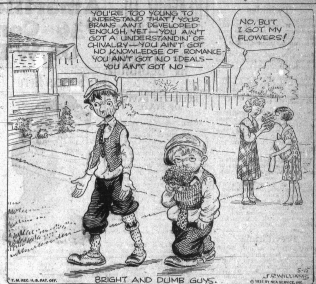
BRIGHT AND DUMB GUYS. BY WILLIAMS