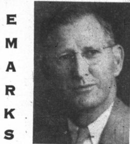
By DICK O'BRIEN