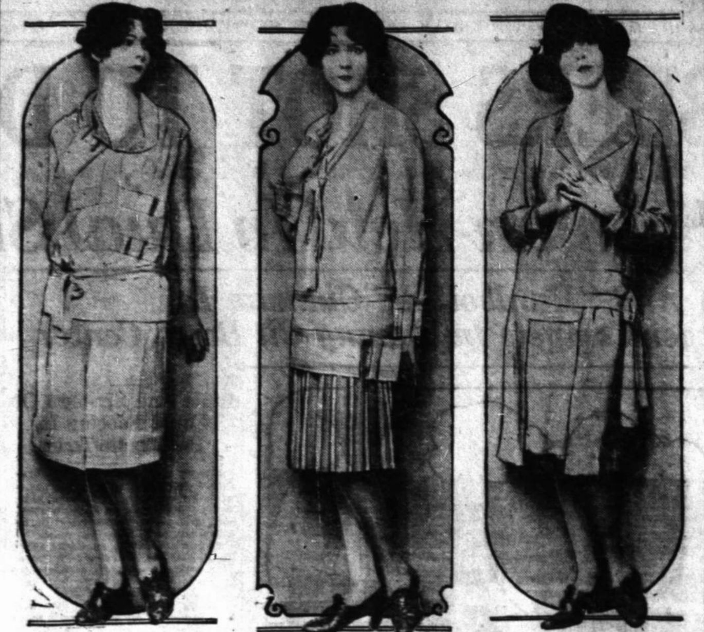
"With interesting jacket effect in velvet or wool." "Suggestive of a stick of peppermint candy." "Apple green crepe, combined smartly with black"

In fact, the sport dress, and modifications of it, have become standard day attire, particularly for the flapper and the young matron. No woman who has kept her figure youthful need hesitate to wear sport attire. And no one need question its absolute propriety for general wear. Pictured today are three of the most approved fall models. The sleeveless model will continue for winter, and usually is shown with an interesting jacket effect in velvet or wool.