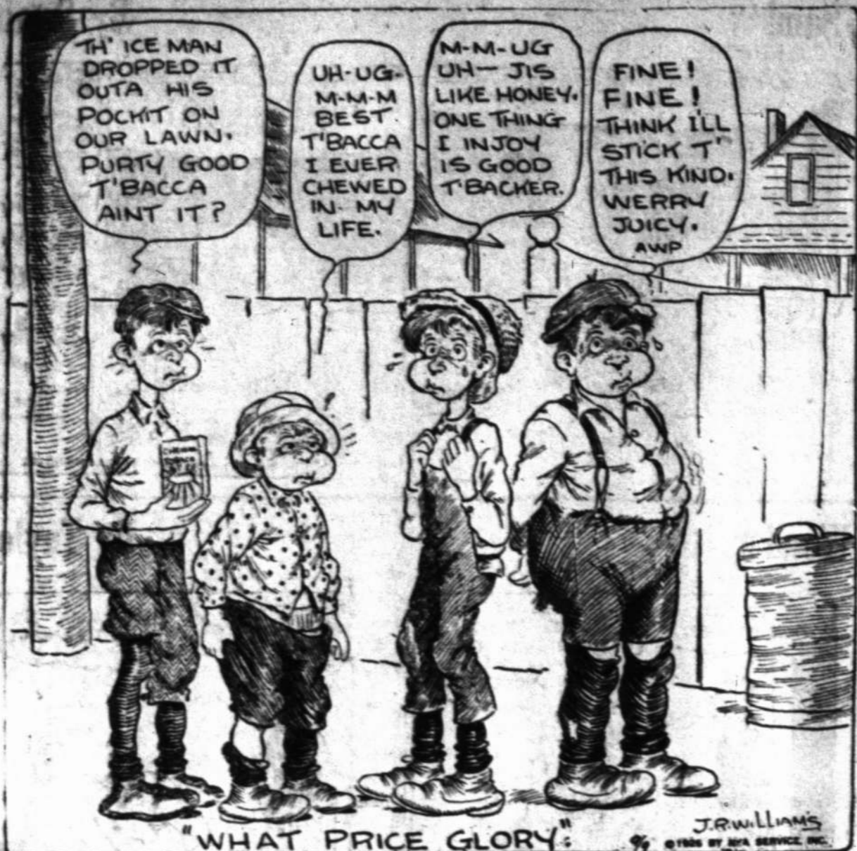
WHAT PRICE GLORY