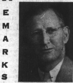
By DICK O'BRIEN