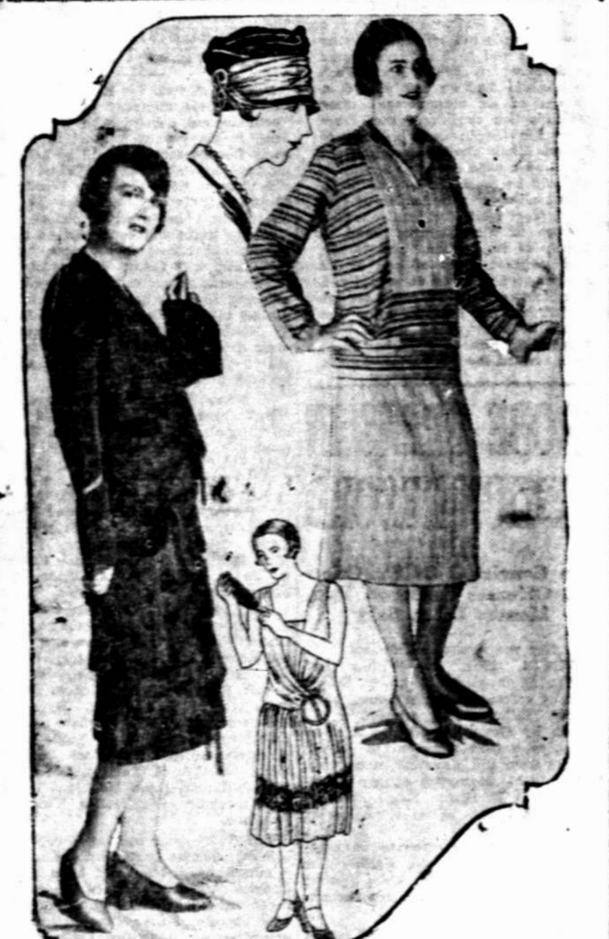
Left is a deep red crepe de chine day frock with pleated flounces, right an outfit of beige with blouse of silk and wool jersey

PARIS, Nov. 22.—No wonder he never noticed it—Aunt Louise and mother have treated me like an infant, and never once have I had a good stage position. However, they cannot efface me so effectively when they return, since I have had my chance.