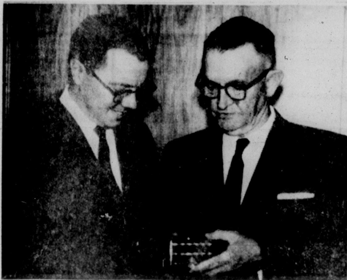
Col-Tex Man for 25 Years Honored

$5 Per Year in Mitchell County—10c Per Single Copy