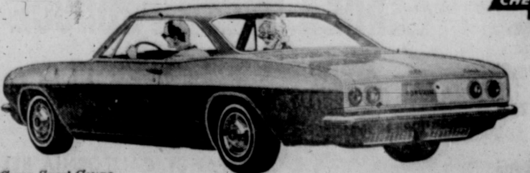
New Corvair Corsa Sport Coupe

'65 Chevrolet It's a longer, lower, wider, roomier, quieter, handsomer, swankier kind of Chevrolet. Fact is, just about everything's new right down to the road. And even that'll seem newer. Because now Chevrolet's Jet-smooth ride is smoother than ever. And we're itching to show it off.