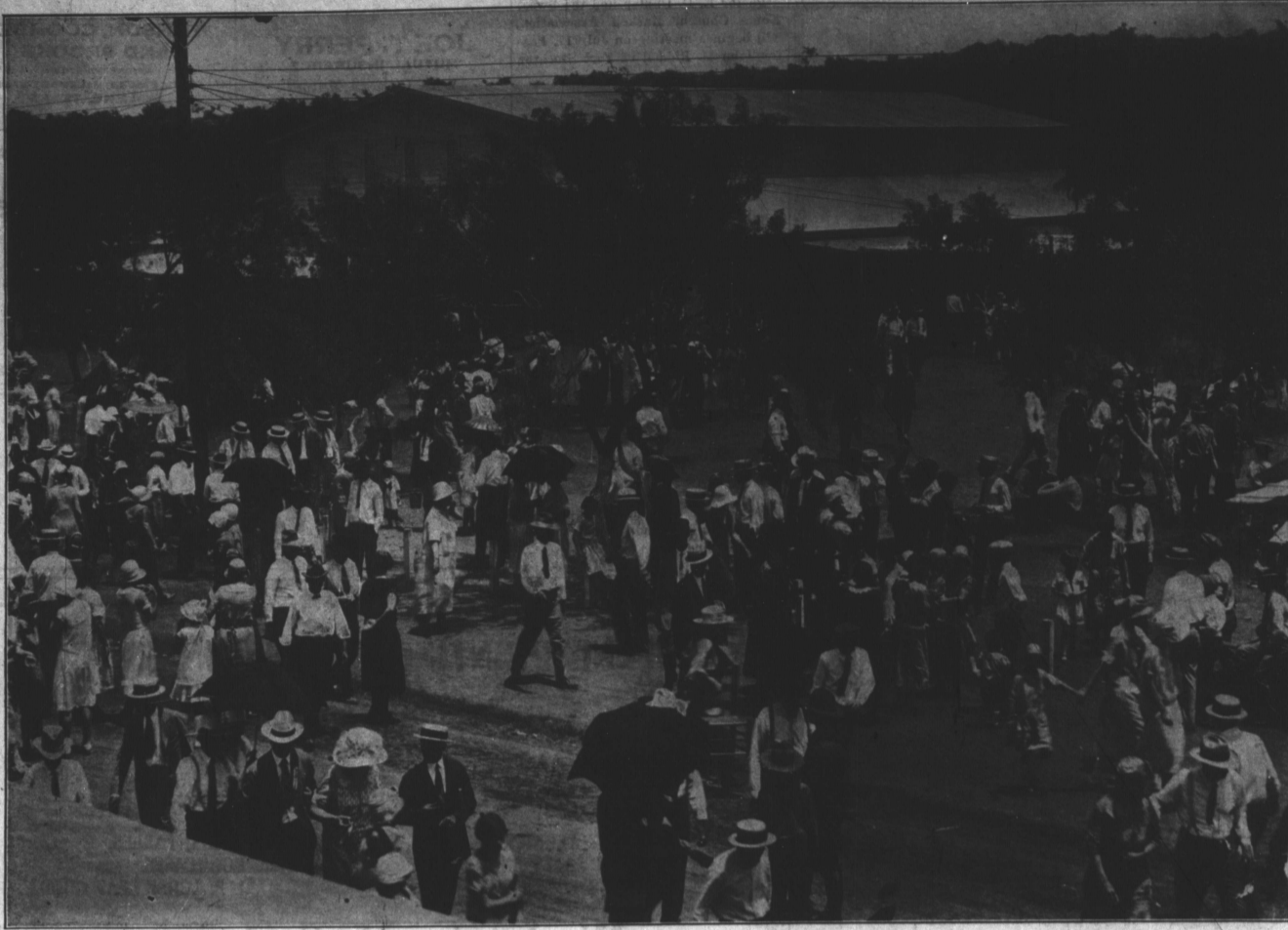
PART OF THE CROWD AT LUE DERS ENCAMPMENT 1925