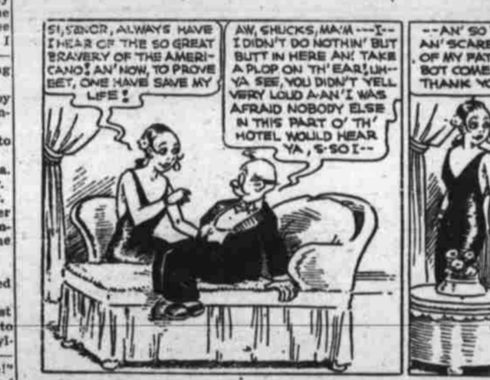
DIANA DANE Trademark Reg. Applied For U. S. Patent Office