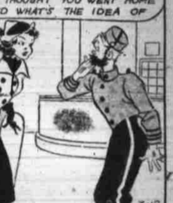
by Noel Sickles