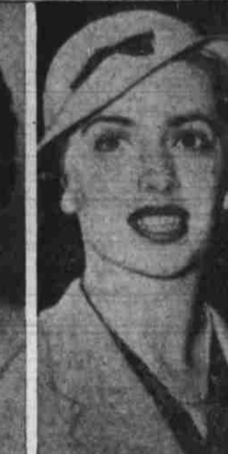
Princess Eugene, Princess Irene and Princess Katherine, all of Greece.