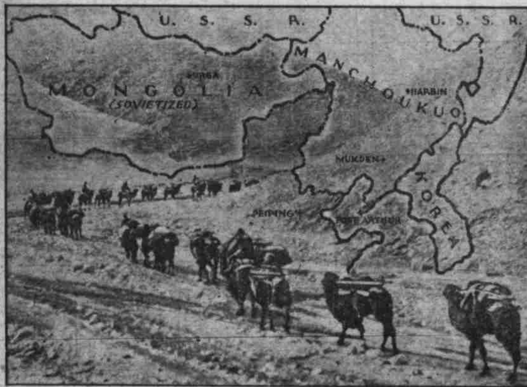
Through grassy deserts a great serpentine camel train is shown carrying a supply of American goods through Mongolia's bleak reaches to far-distant users. World attention is being drawn toward Mongolia, potential theater of a major conflict between soviet Russia and Japan, as flickering strife perturbs the usual solitude of the borderline between Mongolia and Manchoukuo.