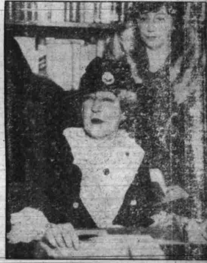
Mrs. Evalyn Walsh McLean put on the dog in a really big way when she went to a Washington, D. C., department store to autograph copies of her autobiography. She put on the famous Hope diamond, which she is shown wearing while she wields a pen.