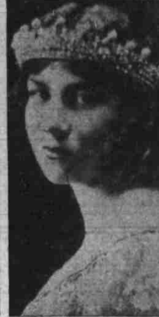
Netherlands; Princess Eugenie, Princess Irene and Princess Katherine, all of Greece.