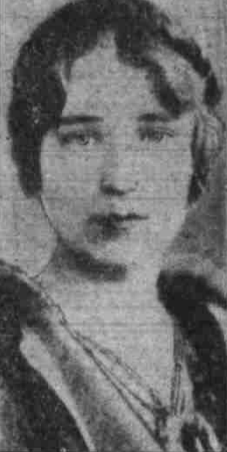
Speculation was renewed over the possibility of King Edward's taking a bride, after the monarch, in a royal decree to the house of commons yesterday in which he recounted the necessity of revivifying the civil list, stated that the possibility of marriage should be taken into account. Only five girls seem