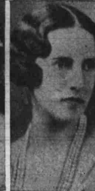
Princess Eugene, Princess Irene and Princess Katherine, all of Greece.