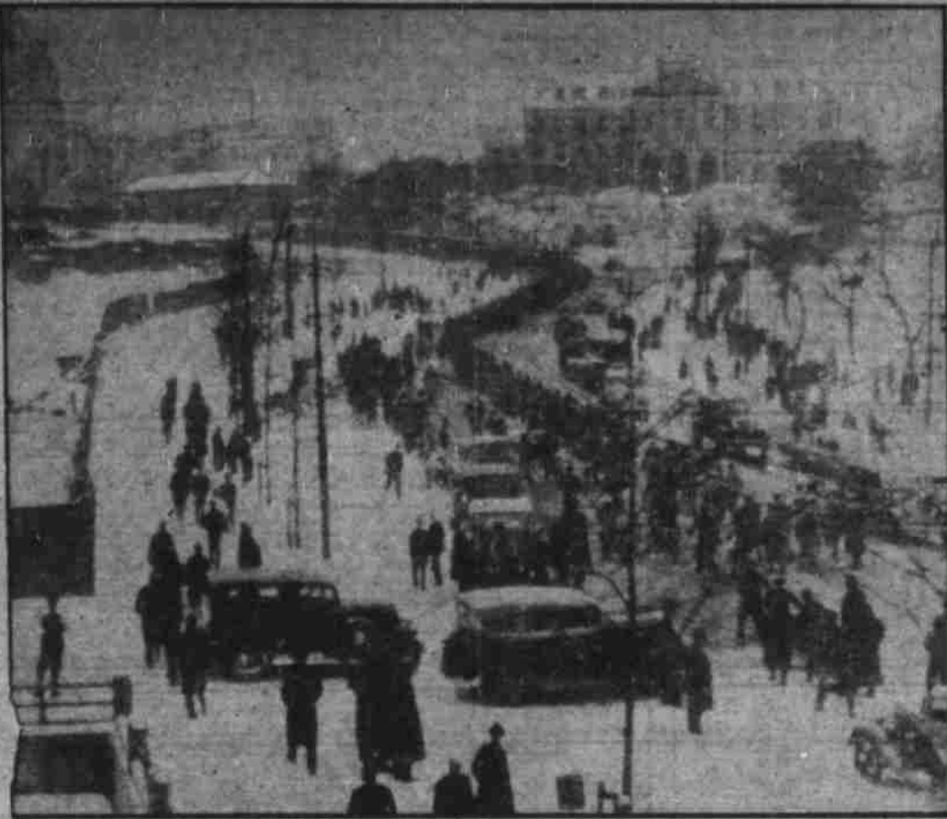
Rebellious Japanese troops who assassinated four government leaders in a desperate militaristic uprising are shown in this first action picture as they marched away from metropolitan police board headquarters in Tokyo and headed toward the parliament building. The parliament building is seen dimly in the upper left. Curious civilians crowd the line of march.