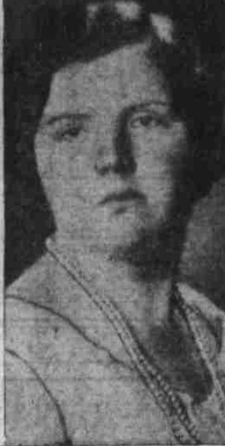
eligible to become his bride. As Prince of Wales he might have married a commoner, but as king, the English law requires that he marry only a royal princess. Should he wed, these princesses appear qualified to sit with him on the throne. Left to right: Grand Duchess Kyra of Russia; Princess Juliana of the