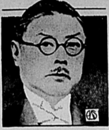
Dr. W. W. Yen, former premier, has been appointed in place of Dr. Wu, who has resigned. Dr. Yen refused the post twice.