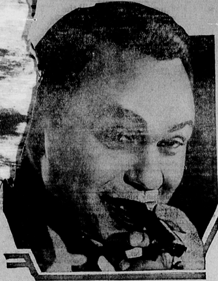
First National Melodrama Starring Edw. G. Robinson at Palace Sun- day-Monday. Hallowe'en Pre- vue Saturday night 11:30

The enthusiastic praise given "Five Star Final," the First National melodrama of newspaper life, starring Edward G. Robinson, at its Los Angeles review was repeated on its Broadway showing, and wherever the starting expose of the evils of yellow journalism, has been shown.