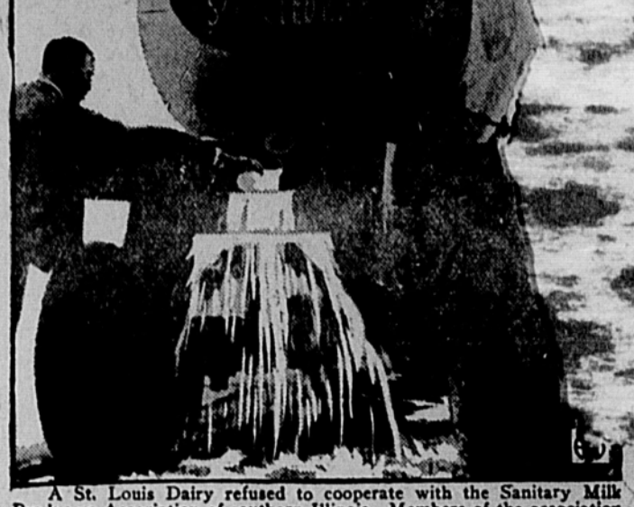
A St. Louis Dairy refused to cooperate with the Sanitary Milk Producers Association of southern Illinois. Members of the association retaliated by holding up a train of milk trucks bound for St. Louis and letting 4,000 gallons flow onto the pavement at St. Jacob, Ill.