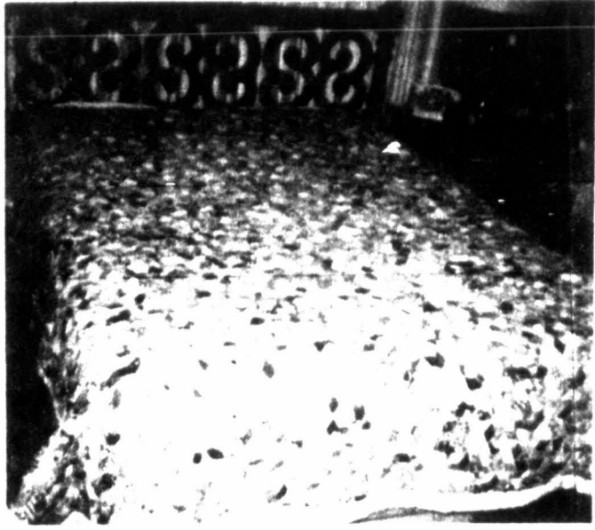
Quilts to be given away, see above story.