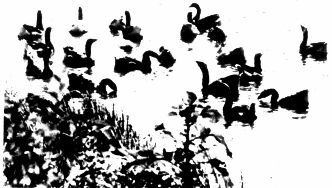
THESE CHARACTERS seem to know where to be when the sun is beaming down and there are no clouds in sight. We could take a lesson from these "cool" quacks, because what better way is there to cool off than to take a dip in the lake?

the water at Lake Colorado City. While most folks were enjoying a little time off, one hard-working local thief tried to a recreationist's boat and pulled the stolen craft up Morgan Creek. In other law enforcement activities over the holiday weekend, local authorities stopped a vehicle south of Loraine. The officers found two male juveniles and one female adult in possession of a white-tail deer shot with a rifle. Justice of the Peace Henry Doss fined the woman $203.50 for possession of a white-tail deer in closed season. The juveniles were turned over to probation officials.