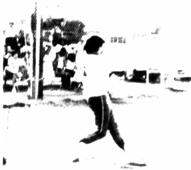
"This Is How It's Done Boys!"