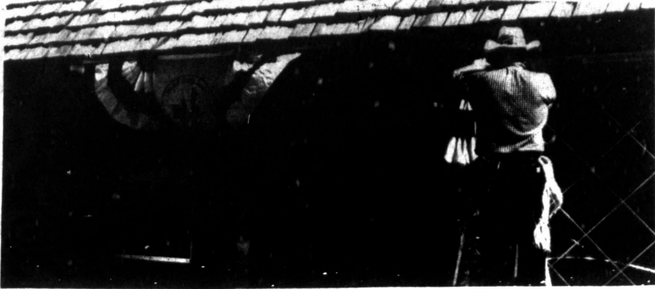
WORKMEN were seen at various businesses in Colorado City last week as city retailers and others get into the centennial spirit by decorating