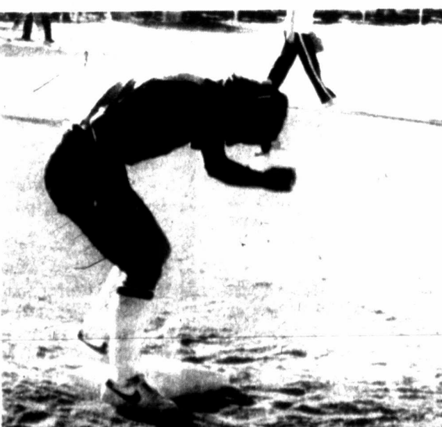
"Oh Shucks, I Made It!"