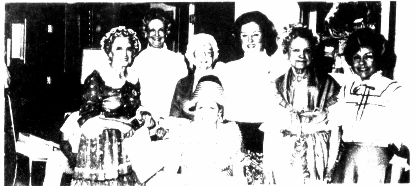
THE "BLUE BELLES," a Centennial chapter of Colorado City, gave a helpful and meaningful contribution to the residents of the three local nursing homes in Mitchell County Thursday afternoon. They presented each nursing home with a cake, Centennial brochures and sang songs for their enjoyment.

"The Centennial Belles" chapter, the "Blue Belles," visited the local nursing homes Thursday afternoon as part of the contribution to the Centennial activities. They visited Kristi Lee Manor, Root Valley Fair Lodge and Loraine Leisure Lodge, where they presented the residents with a cake. They sang songs for the residents and passed out Centennial booklets that held upcoming events, to each.