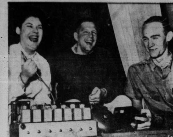
KISSOMETER BUILDERS TEST MACHINE—The Kissometer machine that measures the power put into a kiss is tested by the three electrical students that invented the machine at the University of Miami.