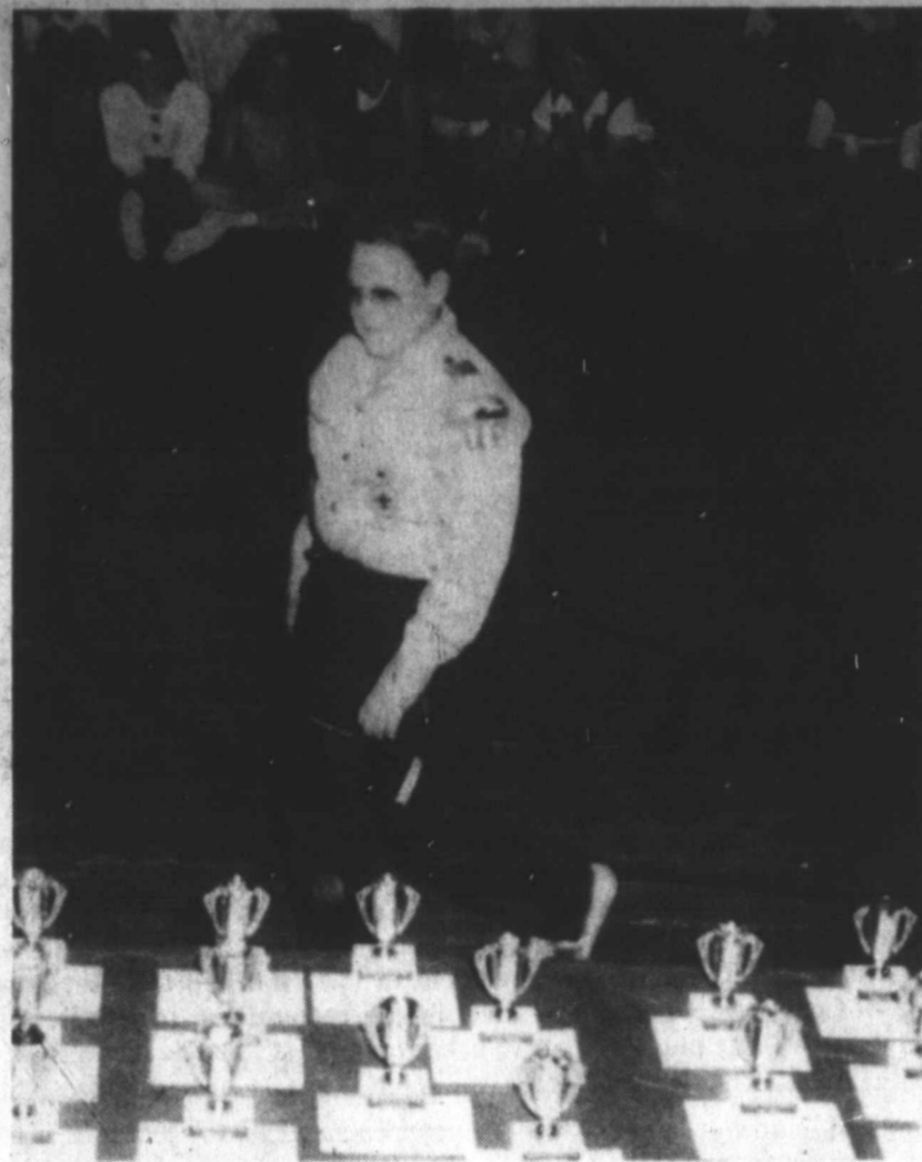
ELEMENTARY AWARDS — The annual elementary awards program was held in the Gardner school gymnasium Tuesday afternoon. Here one of the winners of an award from the Soil Conservation Service passes by the table of trophies.