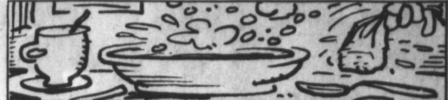
To remove fat from hot soup, put an ice cube in a thin cloth and swirl back and forth in soup; the fat will collect in the cloth.