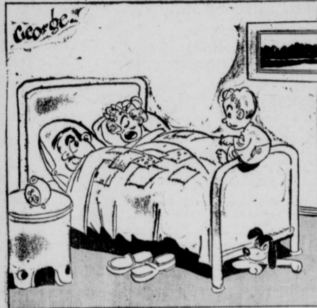
"Leave him be! He only wants to watch you snore!"