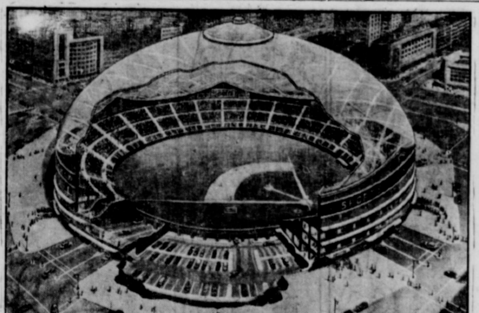
THERE'D BE NO RAINCHECKS—The future home games of the Brooklyn Dodgers may be played under a huge plastic dome, if current plans are followed through. Architect Buckminster Fuller claims the huge, cup-shaped roof over the baseball field would be 300 feet high and 750 feet in diameter. The air-conditioned, all-weather sports center would have a seating capacity of more than 55,000, as compared to 32,000 for Ebbets Field. Artist Frank Tinsley envisions a cut-away view of the finished stadium, above. This artist's conception of the huge sports facility is from July issue of Mechanix Illustrated.